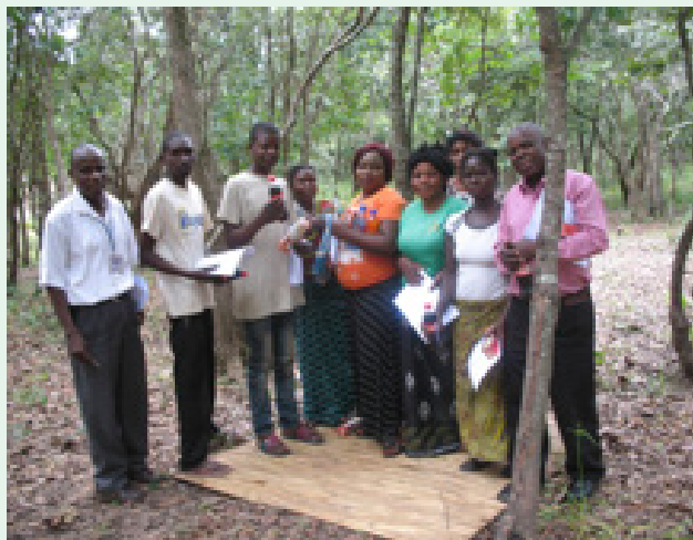
Land Committee members of Ikelenge chiefdom

Our research participants emphasised that gender is not only a question of access to resource and opportunities, but also shapes how men and women understood themselves, such as through understandings of male power and sexual prowess which were seen as particularly damaging in the context of the HIV and AIDS crisis. As one male NGO participant explained: “In Tonga we say, ‘Mulombwana Munyati’ (‘A man is a buffalo’). This slogan has even ended men into trouble... where there is AIDS there, because ‘a man is a buffalo’, he will go there and wants to prove that he is really a man. And that’s why actually you have seen so many men are dying because of that notion.”