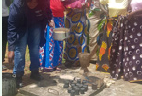
A training session at Kansanshi Mine