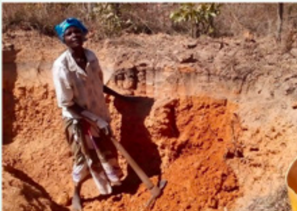
Silica mining without protective clothing

Future-preneur/STS Zambia (FPSZ) therefore worked to increase dialogue between these women and the mining companies, cutting out the need for the middle men. They were organised to meet with local government officials to raise their concerns, and provided with training to effectively negotiate on behalf of the 488 members of the cooperative. As a result of meetings with the Mopani mine, the women now sell directly to the mining company at K400 per tonne. With the increased price for silica stones they are now saving to buy their own machine to wash and crush the silica, and continue to increase profit.