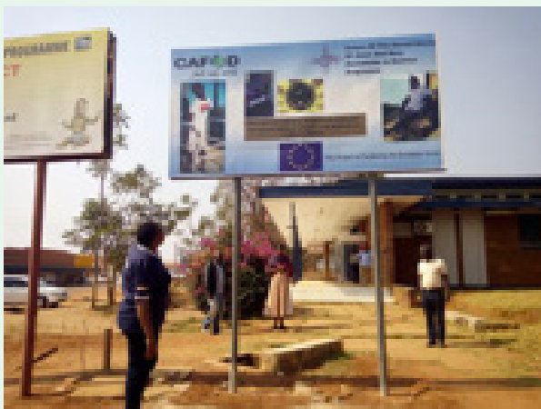
Billboard in Mbala district near the Finance Bank to enhance visibility

In addition to raising the visibility of rights for people with disabilities, the Inclusion for All project is also advocating for the implementation of the 2012 Disability Act in Zambia which makes it mandatory for every building to be accessible for persons with disabilities. The project has also set an example for five key public infrastructures by providing infrastructure modifications. These include rail guides, and in some instances widening the doors or door frames to ensure that wheel-chair users are able to enter rooms and buildings.