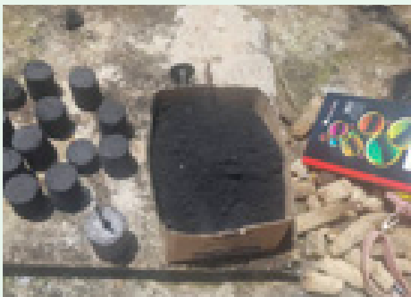
Converting maize stalks into green charcoal

The challenges of this project have been the dominant reliance on charcoal burning as a source of income and fuel for cooking. This alone makes it tough to sway a community dependent on conventional charcoal fuel for domestic use and earning to a whole new method of doing things, even if it may prove more beneficial in the long run. High levels of illiteracy and education about the environment means that the communities lack awareness of the effects of charcoal burning.