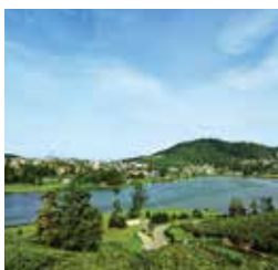
HIKE TO SINGLE TREE MOUNTAIN OR PEDROSTATE VIEW POINT