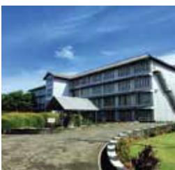
TEA FACTORY TOUR