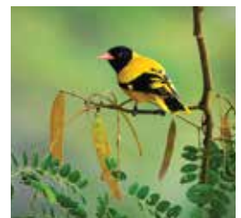
WILDLIFE OR BIRD WATCHING TOUR