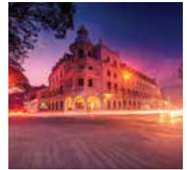
KANDY CITY TOUR