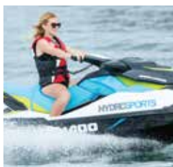
JET SKIING OR PADDLEBOARDING