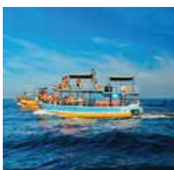
WHALE OR DOLPHIN WATCHING