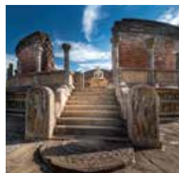
HISTORIC AND RELIGIOUS LANDMARK TOUR