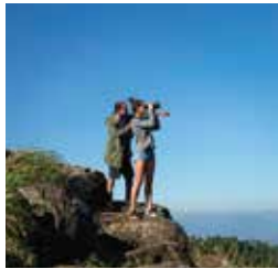
BIRD OR BUTTERFLY WATCHING TOUR