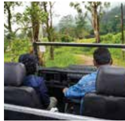
OPEN-TOP DEFENDER RIDE