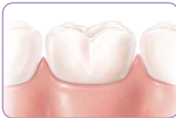
Healthy teeth and gums

The check-up should also include your tongue, throat, face, head and neck. This is to look for any signs of trouble, swelling or cancer.