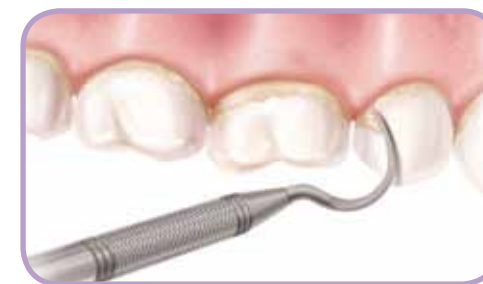
Scaling removes plaque and tartar

Brushing and flossing help clean the plaque from your teeth. But you can't remove tartar at home. During the cleaning, your dental professional will use special tools to remove tartar. This is called scaling .