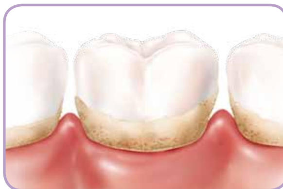
Plaque and tartar build-up