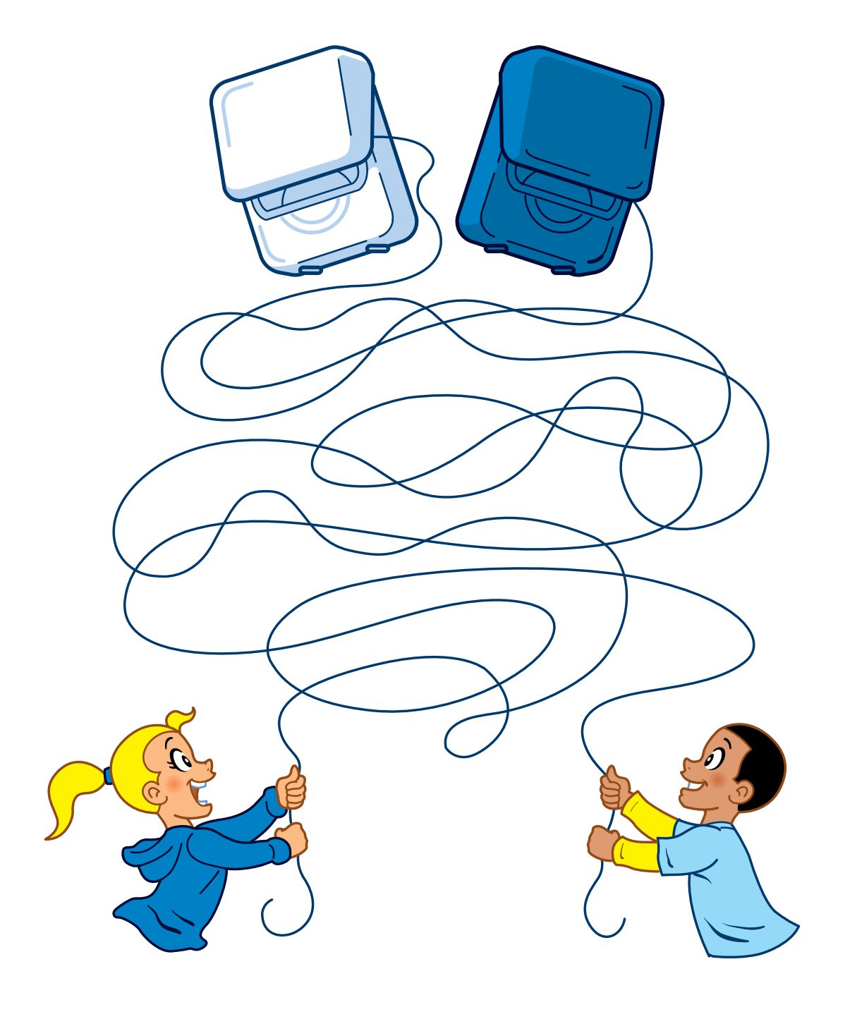
Remember to floss every day for a healthy smile!

Can you help untangle the floss so they can keep their smiles healthy and bright? Trace the floss that leads to the boy and the floss that leads to the girl.