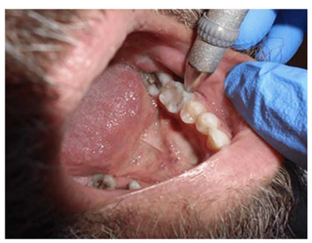
Figure 1. Percussion testing on tooth No. 19 performed by tapping the buccal tooth surface with the opposite end of a dental mirror.

Weisleder et al<sup>5</sup> reported that the cold test and EPT used in conjunction resulted in a more accurate method for proper pulpal diagnostic testing. In another study, Jespersen et al<sup>6</sup> reported that a pulp-testing spray and EPT are accurate