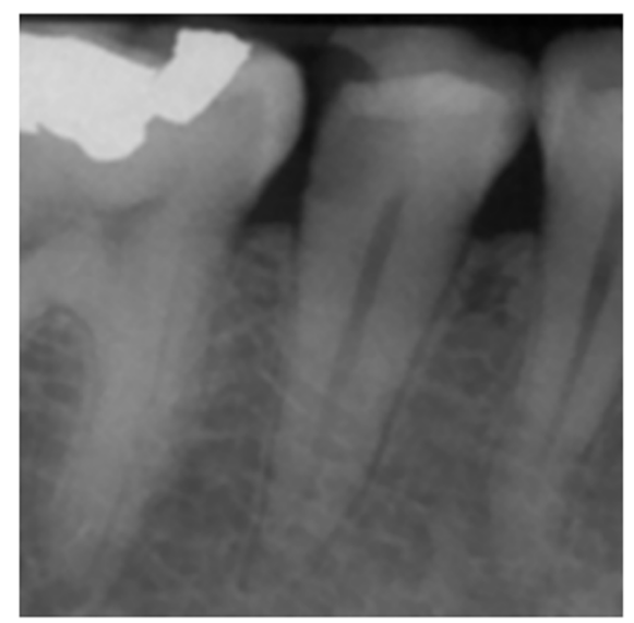
Figure 3. Determining a diagnosis with a radiograph only can lead the clinician to treat tooth No. 29 because of the distal decay. However, if the proper diagnostic tests are performed on tooth No. 29, it should reveal the pulp tested necrotic and it is tooth No. 30 that has a symptomatic irreversible pulpitis.

Normal pulp tests within normal limits to cold. Clinically, a patient will respond to a cold stimulus, and after the stimulus is removed, the cold sensation will dissipate immediately. The length of time it takes for a patient to respond to cold has no correlation to the diagnosis and therefore does not need to be recorded.