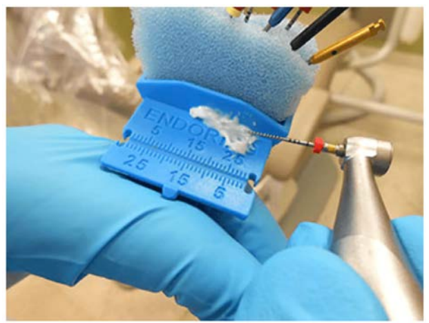
Figure 8. The placing of an EDTA gel on an endodontic file before placement in a canal.

Although there are many different file techniques for conventional endodontic treatment, the modified crown-down technique is a consistent and efficient method of treatment.<sup>33</sup> The technique involves opening the coronal twothirds of the canal with rotary files. Several types of "orifice opener" rotary files are on the market. Next, the rotary files should be taken to working length and worked up from smaller- to largersize files. It is recommended to use a 0.04 taper rotary-file system when preparing the root canal for obturation. The last rotary-file size that can be