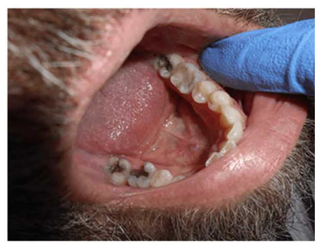
Figure 2. Palpation testing on tooth No. 19 performed by pressing index finger around the buccal and lingual gingiva.

When evaluating tooth mobility, the clinician must remember that movement may be endodontic or periodontal in nature. In the case of periodontal