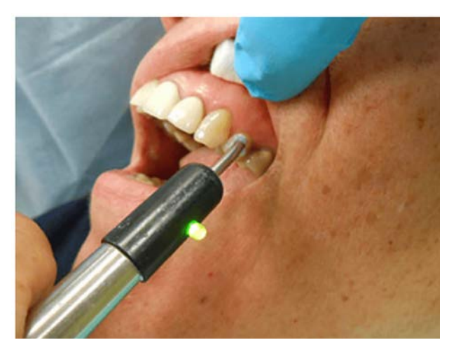
Figure 7. An electric pulp test (EPT) is used to test a treatment tooth before and after giving local anesthesia to confirm profound pulpal anesthesia.

Therefore, before giving local anesthesia for endodontic treatment, the dentist should objectively test the treatment tooth with a cold test and/or EPT. With a preoperative baseline of the pulp sensibility level, after anesthesia is "onboard," the level of anesthesia can be accessed by re-testing the treatment tooth with cold or EPT (Figure 7). If the post-anesthesia tests are either negative to cold or reveal no response to EPT, there is a high likelihood that