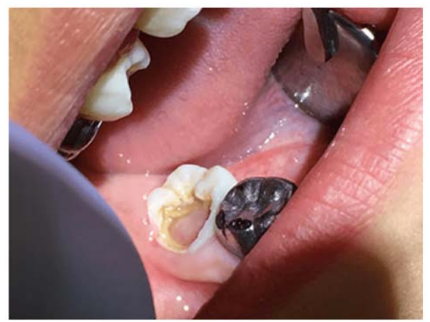
Figure 4. A pulp polyp is a clinical example of an asymptomatic irreversible pulpitis diagnosis.

Acute apical abscess is an inflammatory reaction to pulpal infection and necrosis characterized by rapid onset, spontaneous pain, extreme tenderness of the tooth to pressure, pus formation, and swelling of associated tissues. There may be no radiographic signs of destruction, and the patient often experiences malaise, fever, and lymphadenopathy.