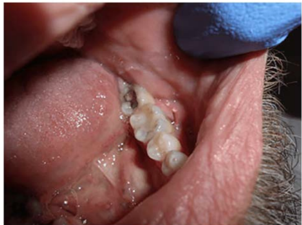
Figure 5. Clinical confirmation of the periradicular diagnosis—chronic apical abscess on tooth No. 19. The tooth is not sensitive to percussion or palpation. A gutta-percha cone is inserted into the sinus tract.