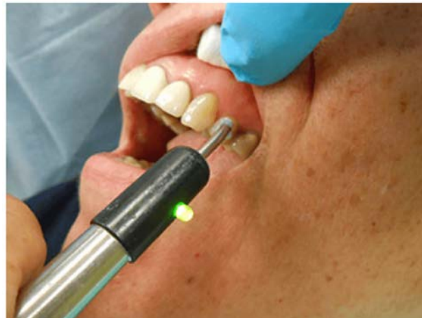
Figure 7. An electric pulp test (EPT) is used to test a treatment tooth before and after giving local anesthesia to confirm profound pulpal anesthesia.

Condensing osteitis is a diffuse radiopaque lesion in the periapical region. The opacity represents a localized osseous reaction to a low-grade inflammatory stimulus.