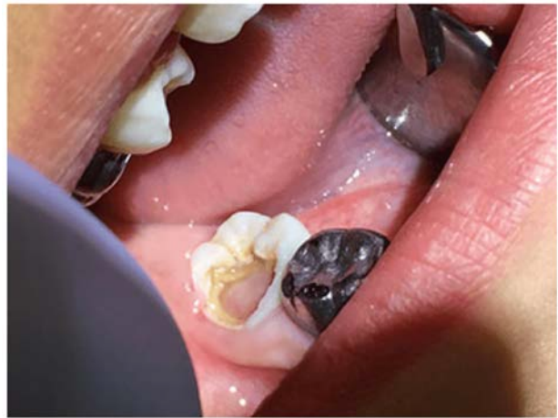
Figure 4. A pulp polyp is a clinical example of an asymptomatic irreversible pulpitis diagnosis.

Acute apical abscess is an inflammatory reaction to pulpal infection and necrosis characterized by rapid onset, spontaneous pain, extreme tenderness of the tooth to pressure, pus formation, and swelling of associated tissues. There may be no radiographic signs of destruction, and the patient often experiences malaise, fever, and lymphadenopathy.