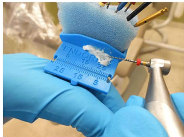
Figure 8. The placing of an EDTA gel on an endodontic file before placement in a canal.

Although there are many different file techniques for conventional endodontic treatment, the modified crown-down technique is a consistent and efficient method of treatment. 33 The technique involves opening the coronal two-thirds of the canal with rotary files. Several types of "orifice opener" rotary files are on the market. Next, the rotary files should be taken to working length and worked up from smaller- to larger-size files. It is recommended to use a 0.04 taper rotary-file system when preparing the root canal for obturation. The last rotary-file size that can be