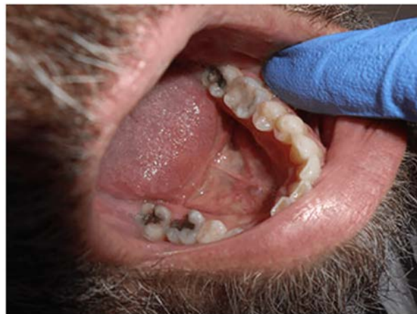
Figure 2. Palpation testing on tooth No. 19 performed by pressing index finger around the buccal and lingual gingiva.