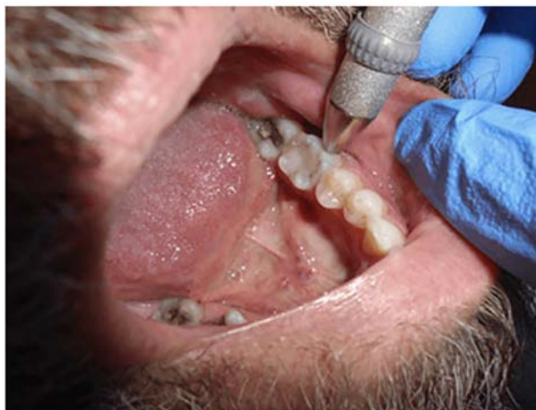
Figure 1. Percussion testing on tooth No. 19 performed by tapping the buccal tooth surface with the opposite end of a dental mirror.

When evaluating tooth mobility, the clinician must remember that movement may be endodontic or periodontal in nature. In the case of periodontal