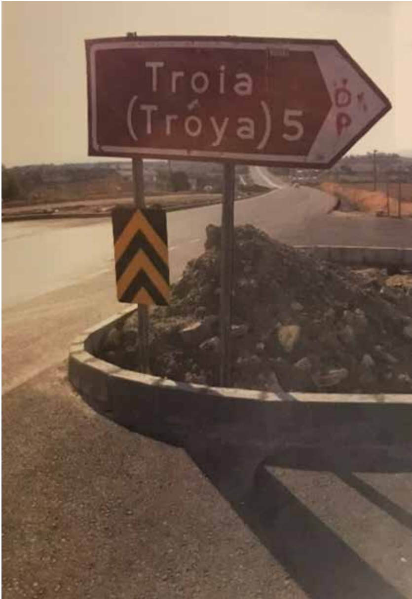
6 November 2012