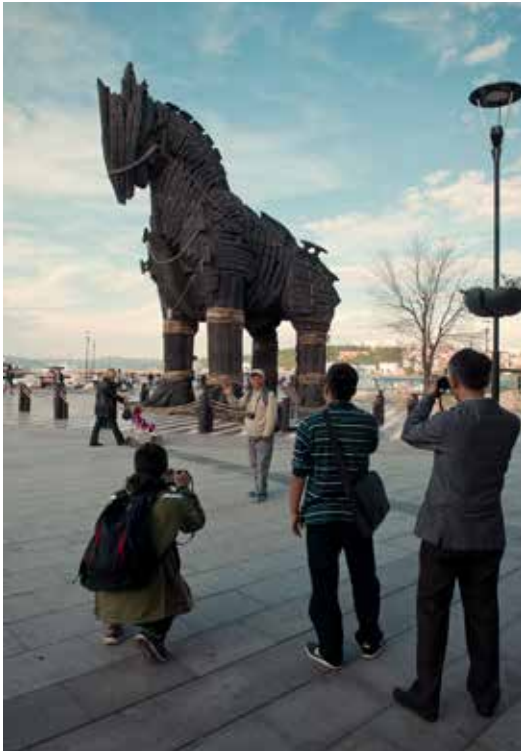
Figure 5 Wooden horse built for the 2004 Hollywood movie Troy in Çanakkale