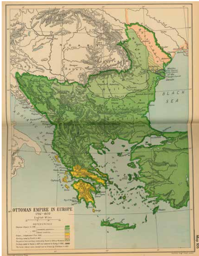
Figure 2 Historical map of the Ottoman Empire in Europe, 1792-1870