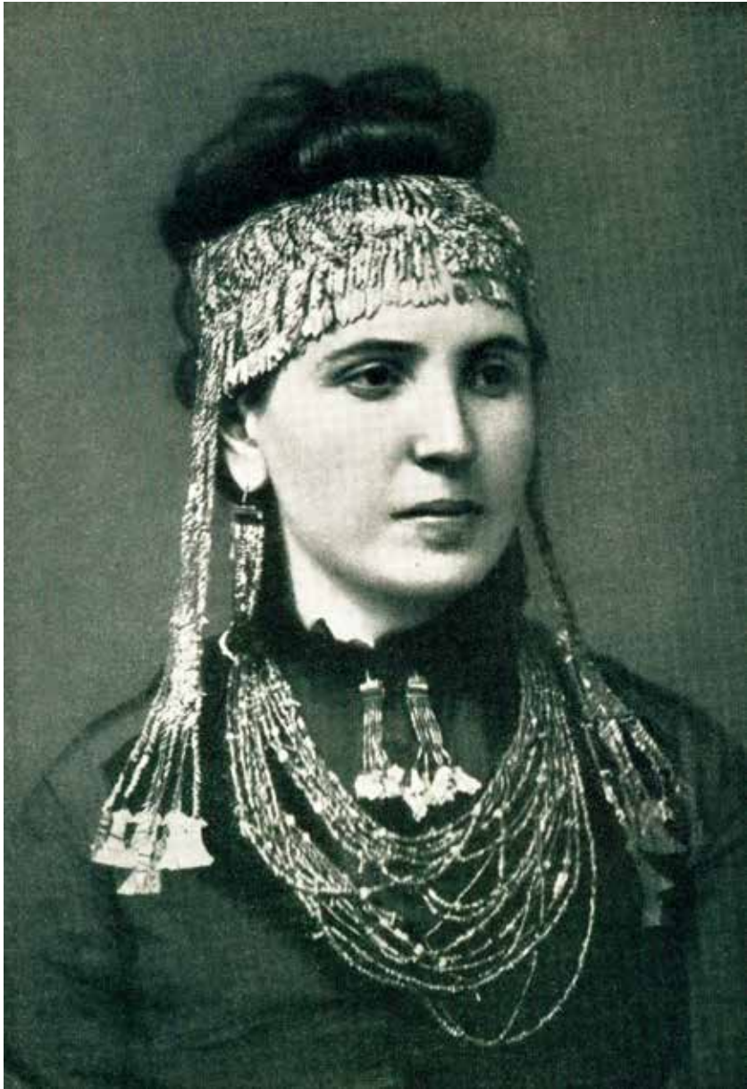
Figure 7 Sophia Schliemann wearing items from Priam's Treasure, c. 1874