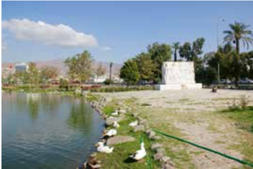
Figure 4 Homer Monument in Izmir, by Turkish sculptor Professor Ferit Özşen, erected in 2002