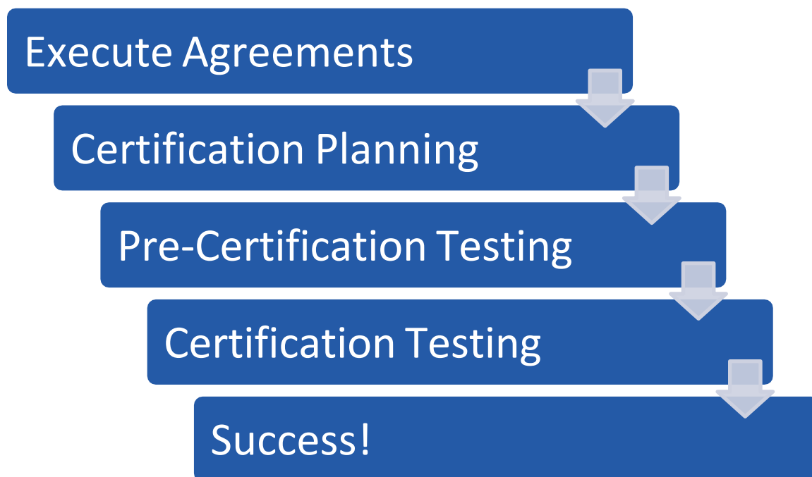
Figure 3- MEF SD-WAN Certification Flow

Figure 3 describes the MEF SD-WAN Product high-level certification flow.