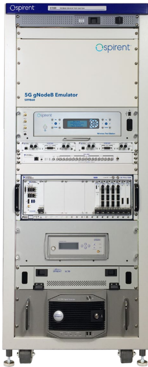
8100 5G location test system