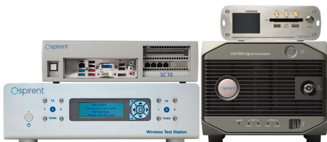
Q750 configuration with optional record and playback unit