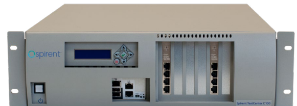
SR5750 Wi-Fi multi-AP system

Accurate positioning in consumer devices leverages GNSS global satellites with assistance from the cell network, called A-GNSS. Yet obtaining a position fix indoors is difficult due to multi-path reflections and multiple sources of interference. In dense urban areas with closely-situated multi-story buildings, just a few feet can make a huge difference in helping to locate persons in need. This is especially important as the public is increasingly using wireless devices as the primary means for contacting emergency services. With GNSS impractical indoors, alternate hybrid positioning technologies are used to either augment or replace satellite positioning.