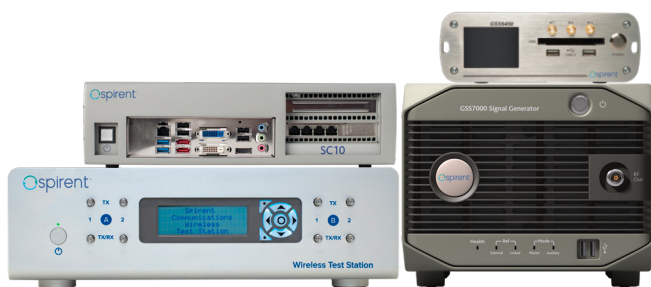
Q750 configuration with optional record and playback unit

GPS L5 is a new and critical GNSS constellation for the industry because repeated simulation and field testing has shown marked improvements in location accuracy, as much as 100 times in certain complicated environments (from an order of meters to centimeters). The Spirent LTS system has supported GPS L5 testing since 2018 and was the first solution to be validated both in GCF and PTCRB as well as in carrier acceptance test plans.