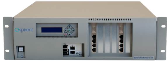
SR5750 Wi-Fi multi-AP system

The 8100 Location Technology Solution is not limited to conducted-mode testing. For OTA testing, Spirent offers seamless integration with leading anechoic test chambers. Spirent always keeps its testing capabilities at the forefront of location technology, ensuring that its customers can focus on their testing, no matter how the industry's OTA test requirements evolve in the future. Spirent is ready right now with the test cases you need for operator acceptance across several major global carriers. The Spirent LTS is completely compliant with current LTE OTA CTIA test requirements.