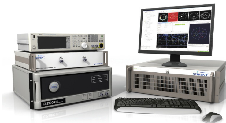
Figure 1 GSS7765 shown with GSS9000

The GSS7765 Interference Simulation System (ISS) is a solution that fully integrates commercial-off-the-shelf (COTS) signal generators as interference sources with Spirent SimGEN-based satellite navigation simulators, such as the GSS9000, GSS7000 and GSS6700. Figure 1 shows a typical solution with the GSS9000: