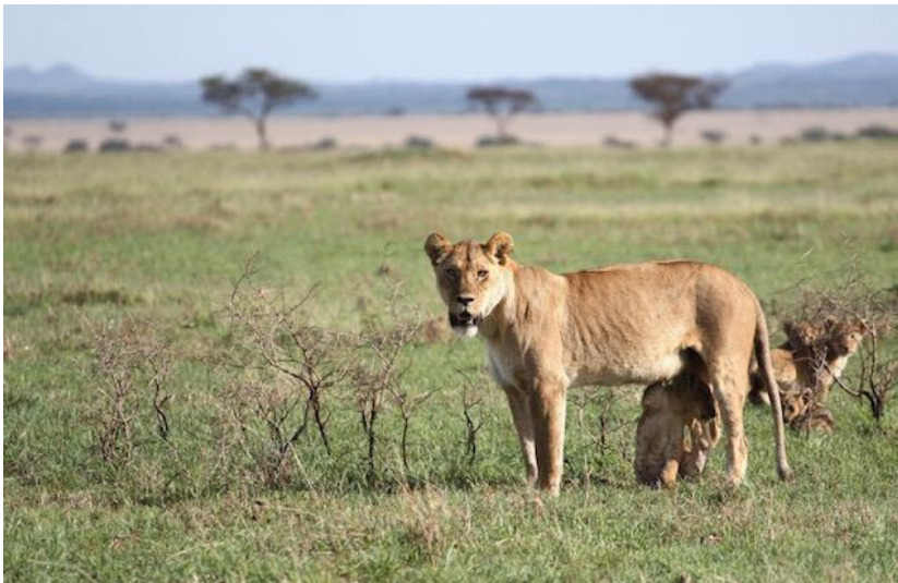
One of the Butamtam lionesses with her cubs.

Bush stories and the April Gallery of images follow.