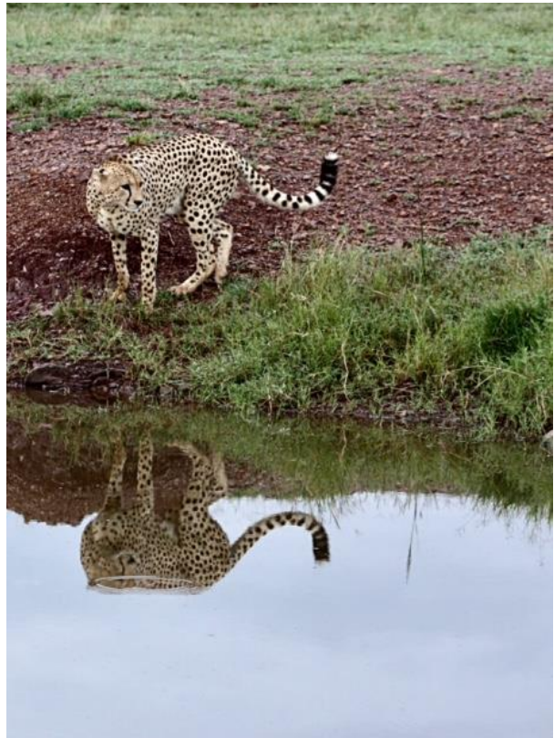
Male cheetah on the move and taking advantage of one of the numerous pans in the area after the April rains.