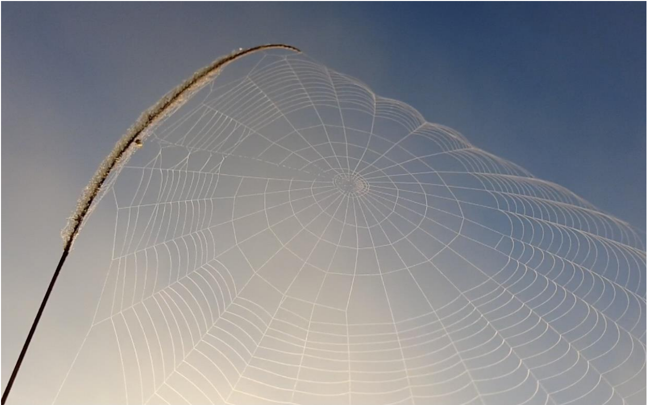
An early morning spider web drying out.