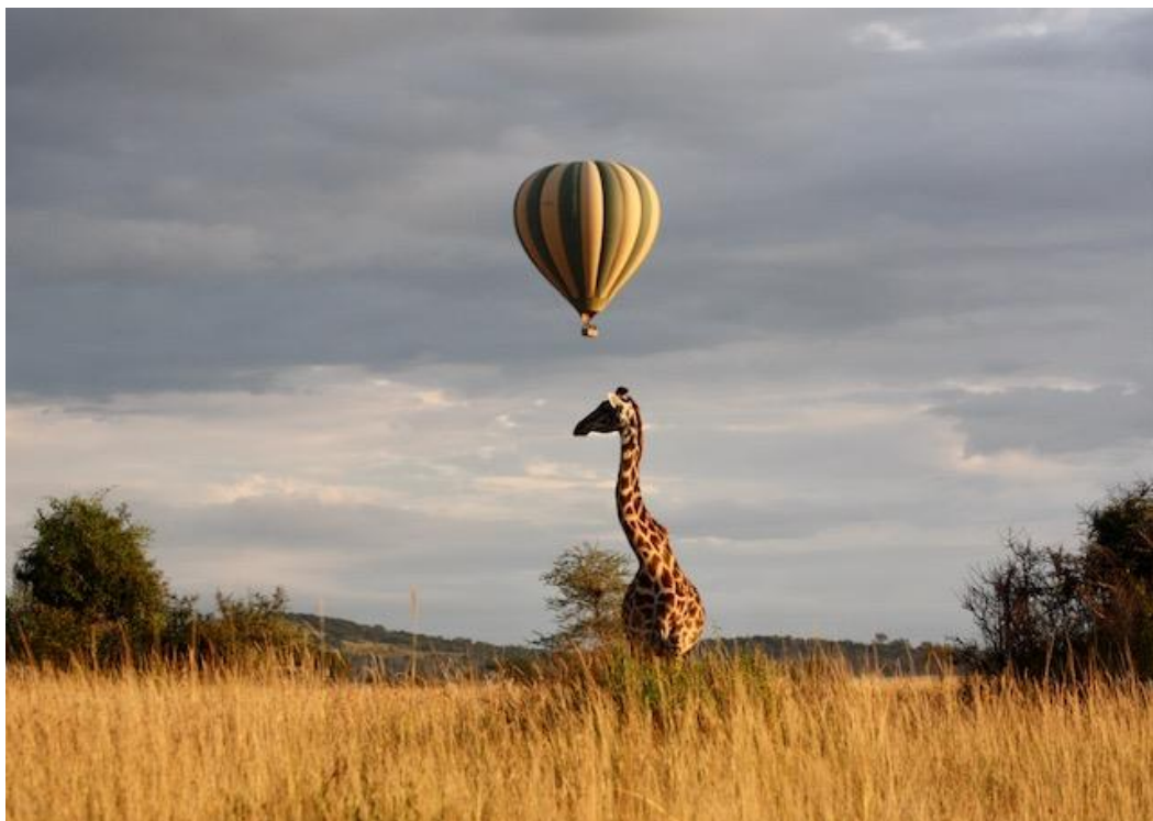
It has been good to see guests back and taking advantage of the opportunity to go hot air ballooning. The short rainy season provides spectacular sunrises and sunsets with the amount of moisture and clouds in the atmosphere.