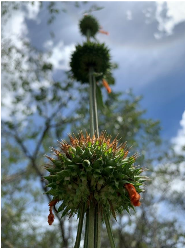
The unmistakable shape and colours of the Lion's Paw – Leonotis leonurus