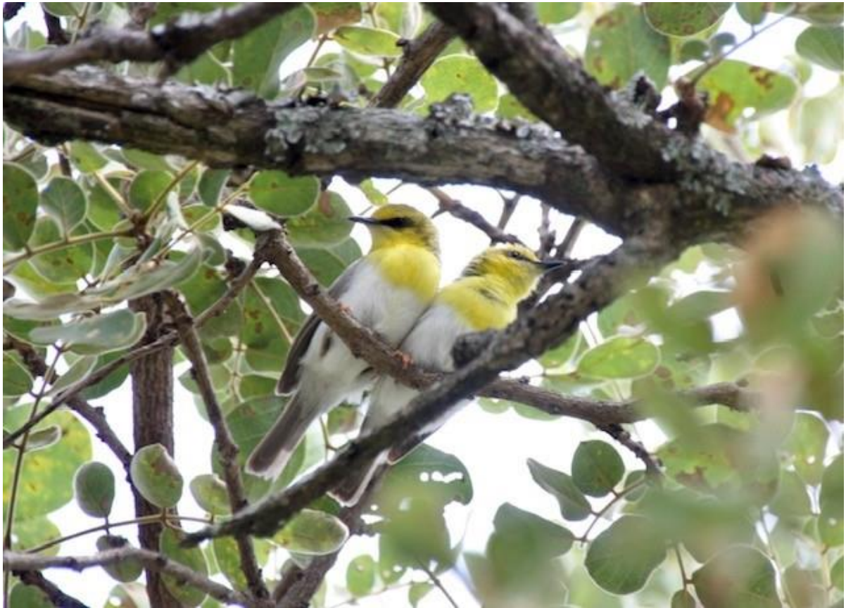
Green-capped eremomela here on SSK hill. A new record for us!