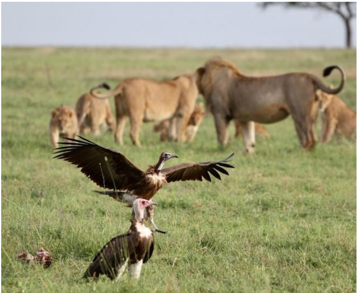
Hooded vultures stay close to the Butamtam Pride.