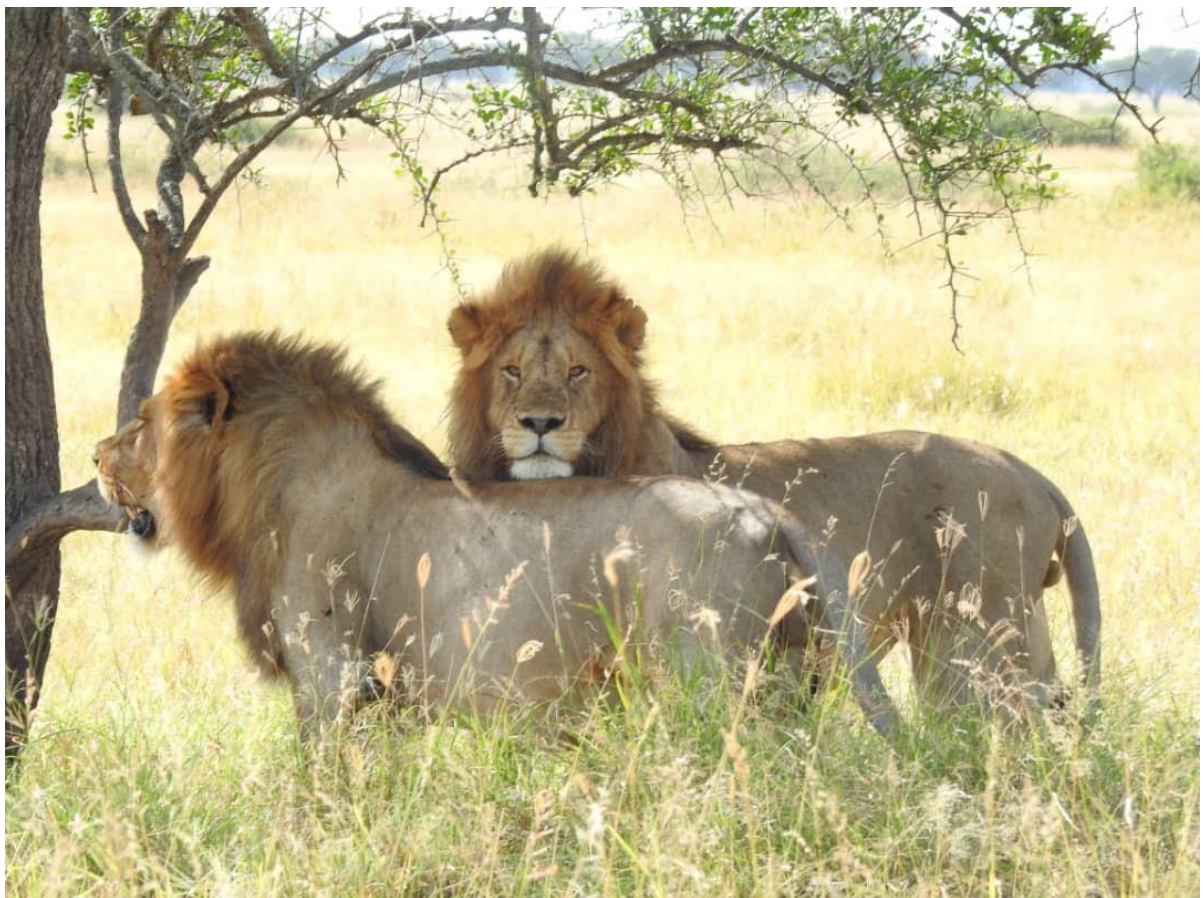
The West Pride boys.