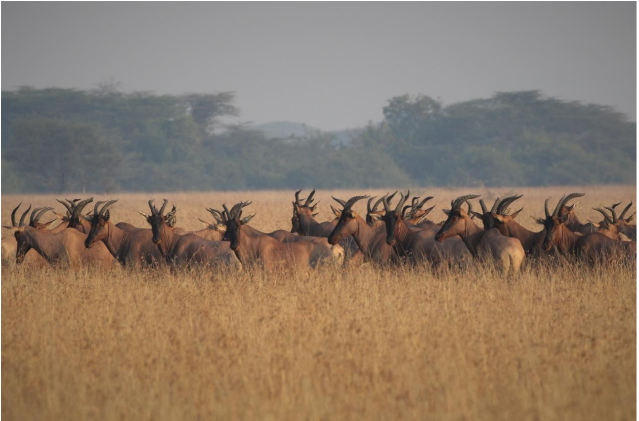
Lovely herds of topi out on the Kawanga plains to the west.