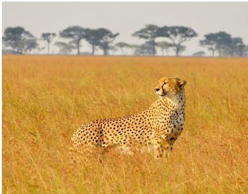
One of the two young brothers casts an eye over the SSK plains.

A bush story follows, as well as the June Gallery of images.