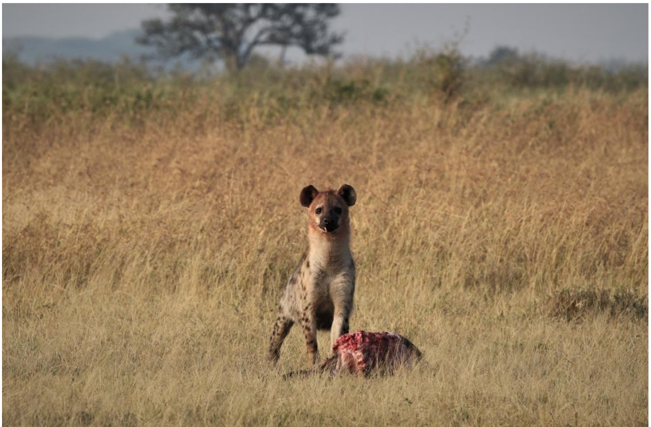
A spotted hyena on a buffalo calf kill on the Gambaranyera grasslands.