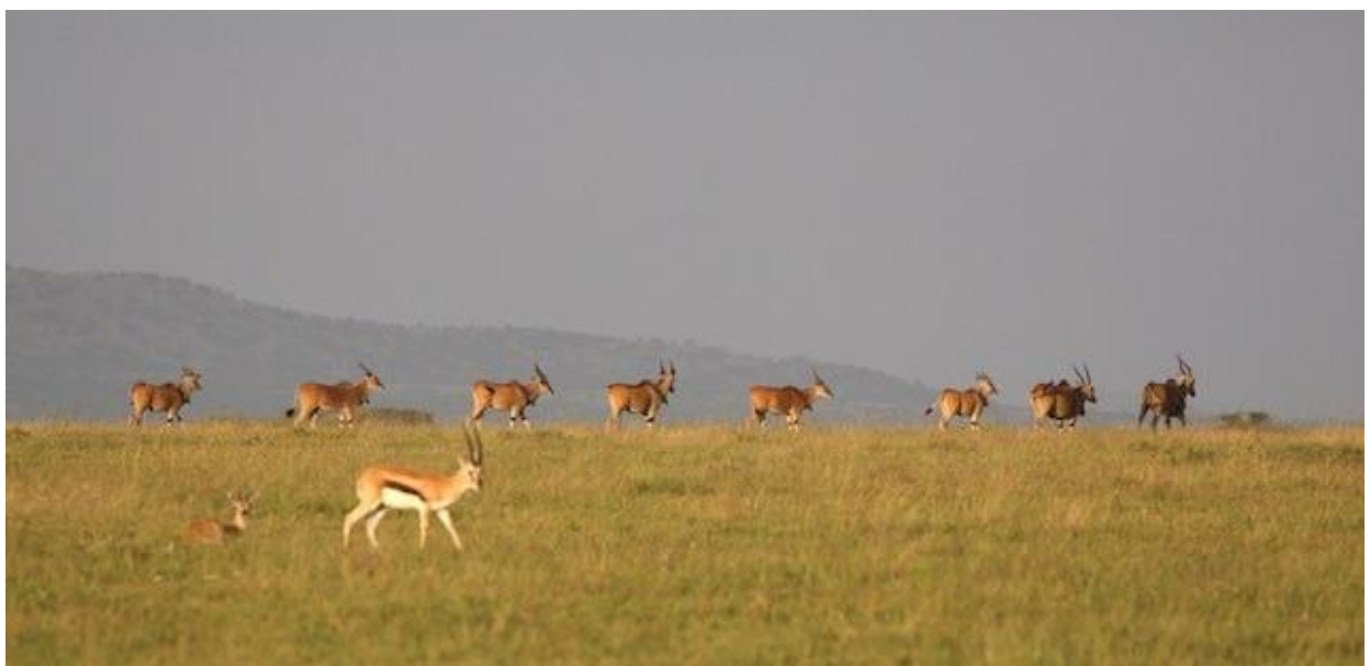
Thompson's gazelles and eland on the Nyasirori high ground, south of Sabora.