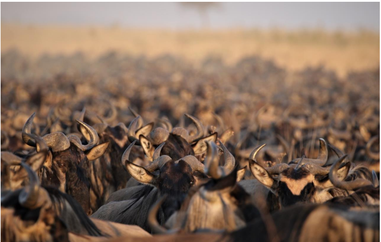
Some lovely numbers on Rhino Rocks towards the end of the month.