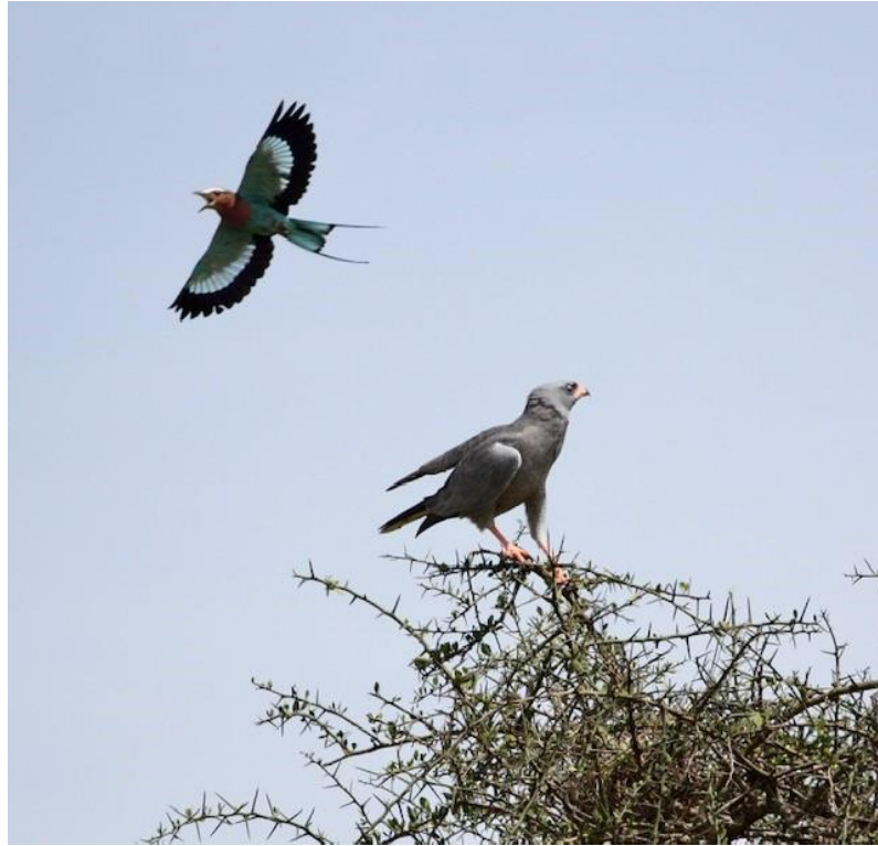
A lilac breasted roller gives a dark chanting goshawk a hard time.