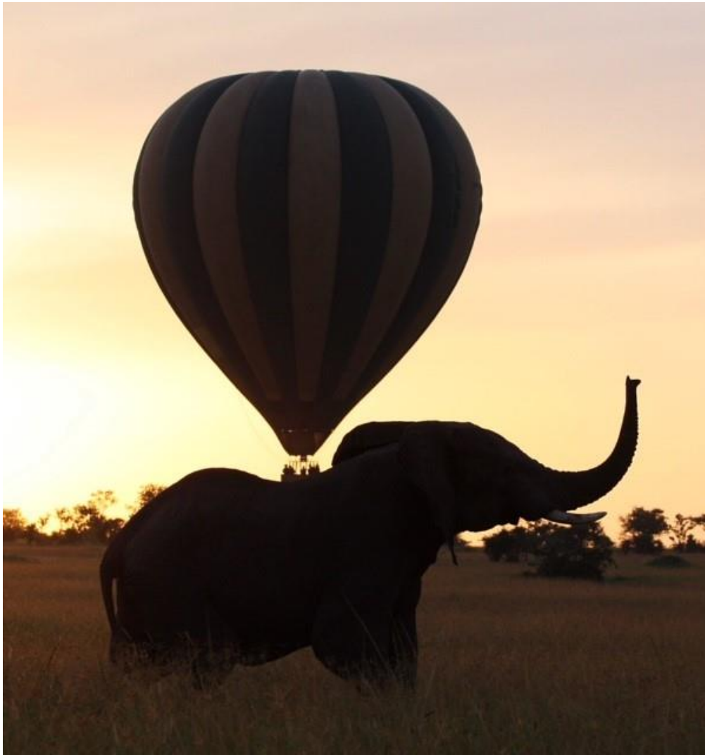
Ballooning with elephants here on the Grumeti.