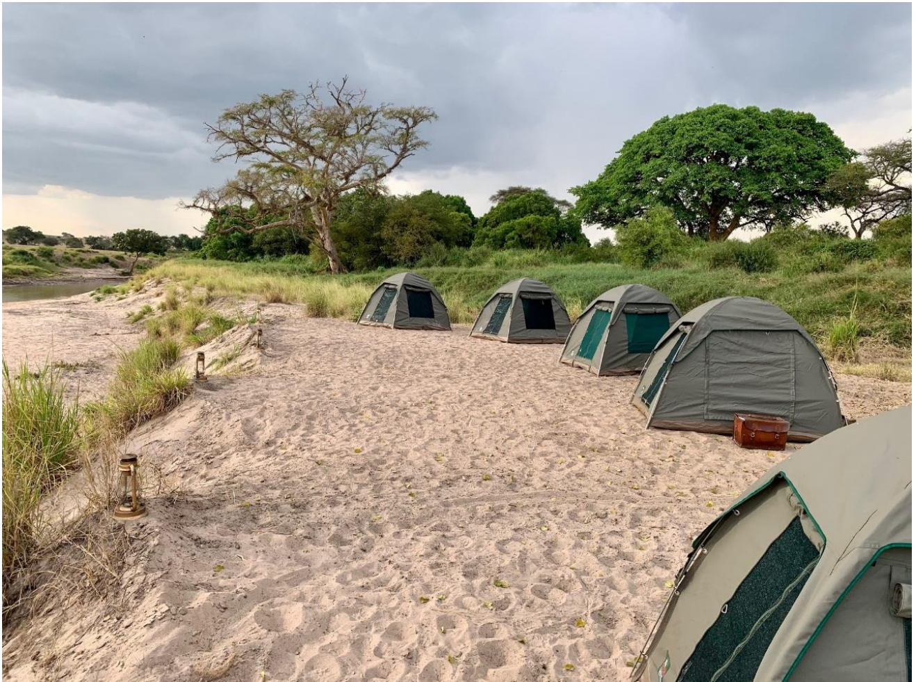
Guide training exercise involving a fly camp on the Grumeti River.

Imagine you decide to have a night just like this at the river bank, setting the tents, preparing the fire whilst the sun sets, walking barefoot in the sand. Sitting by the fire as darkness falls around you, listening to the sounds of the night.