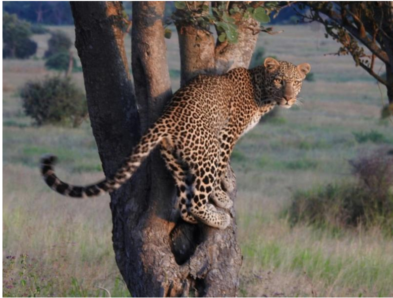
The Grumeti North females' daughter.