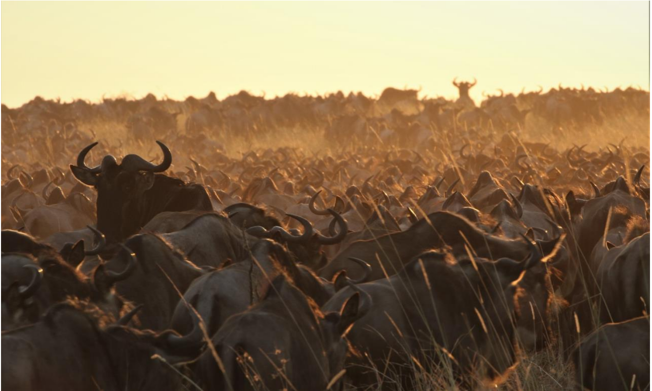
Great herds of wildebeest return to Singita Grumeti.