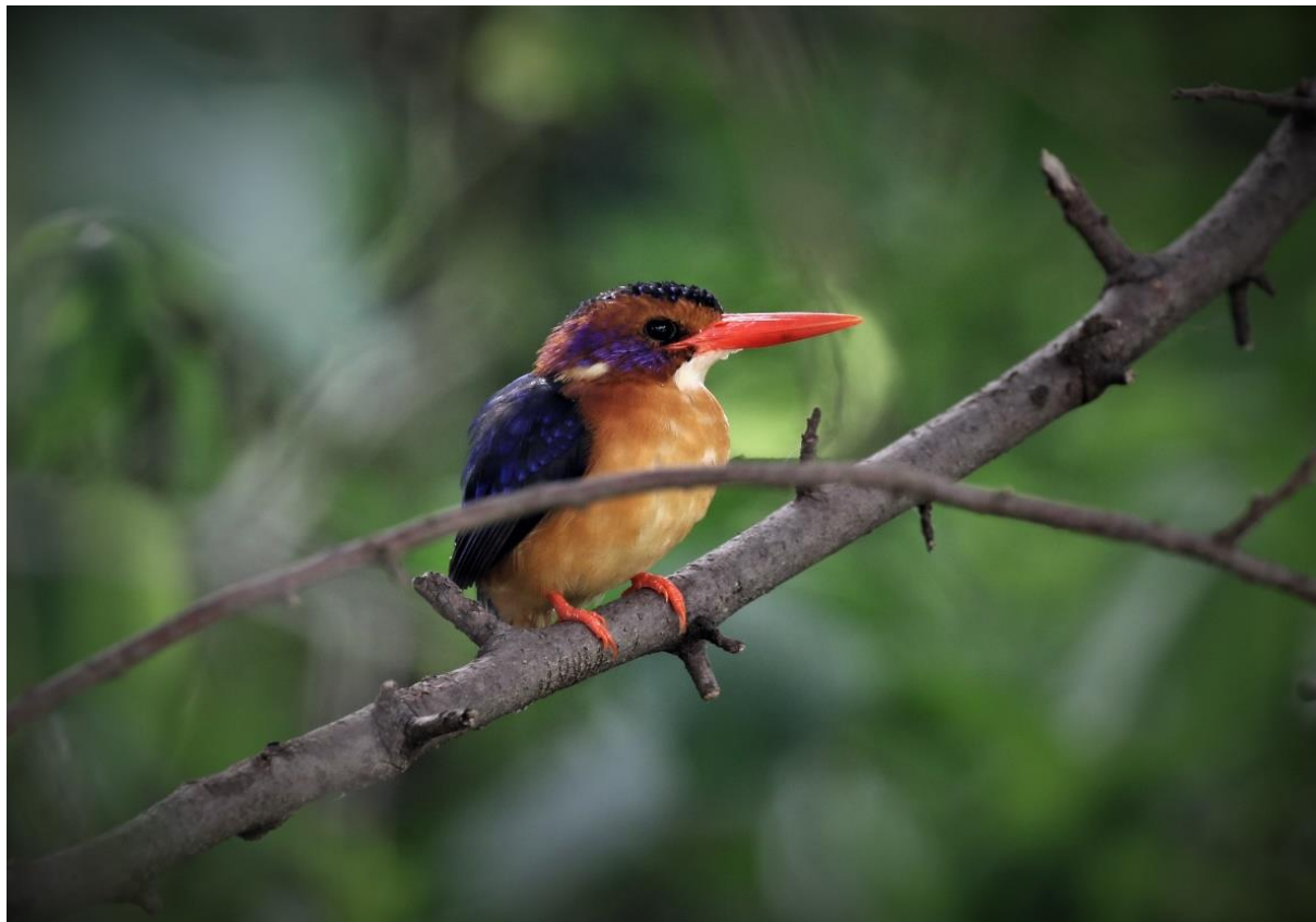
The beautiful pygmy kingfisher taken on the Grumeti River.