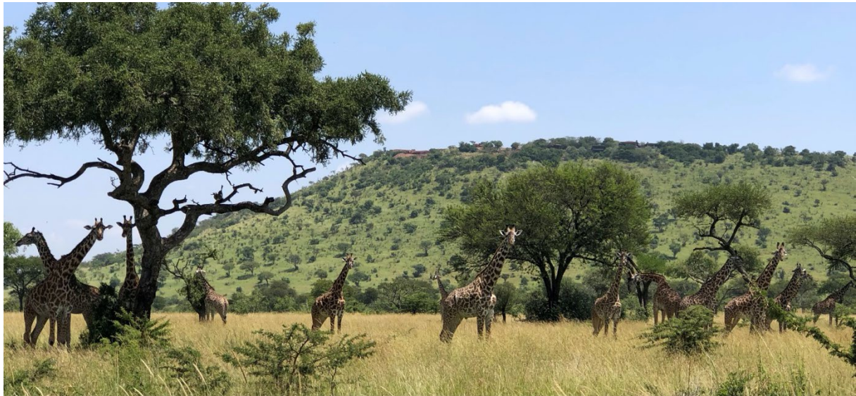
A tower of giraffe standing tall in front of Sasakwa Hill.

A lioness on Sasakwa Hill watches the black rhino statue carefully.