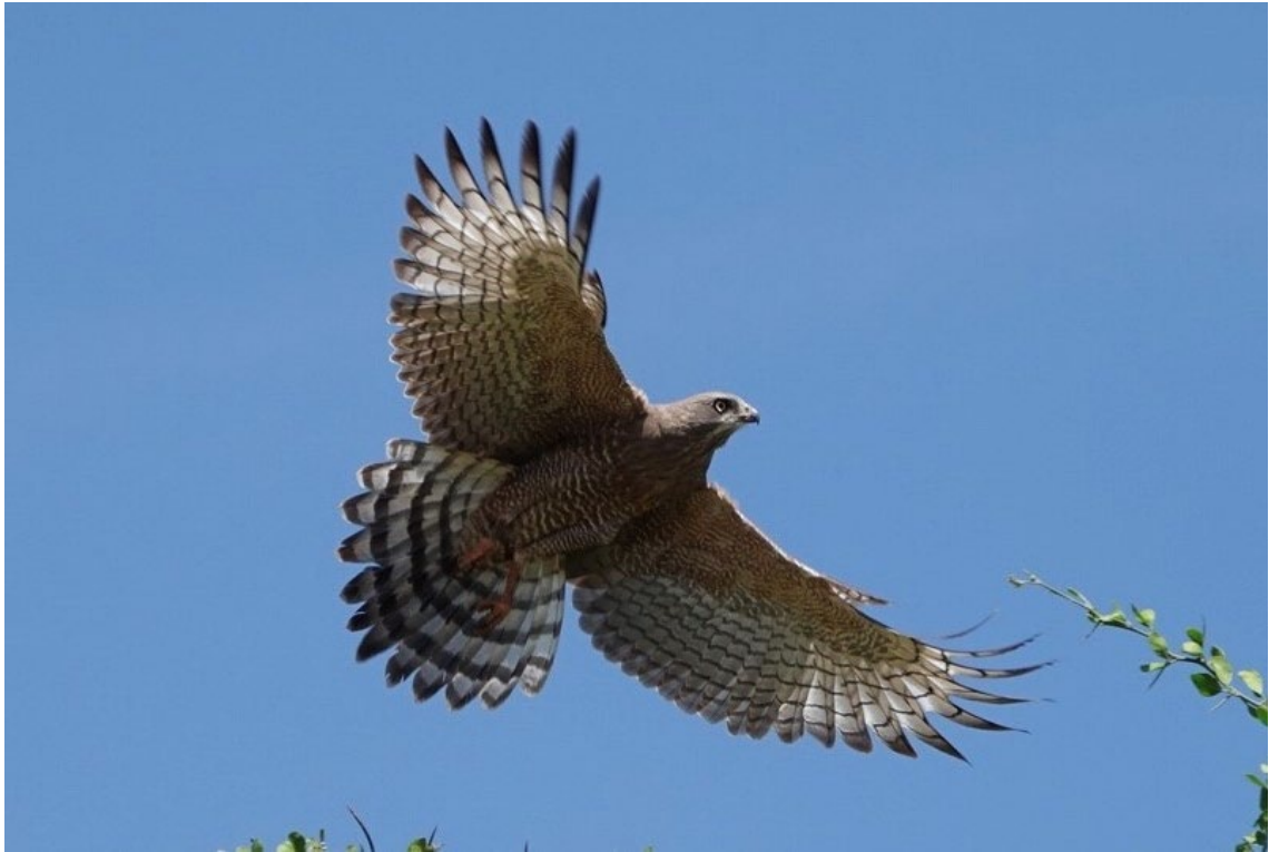
A wonderful capture here of a young dark chanting goshawk. The beautiful Grumeti North female.