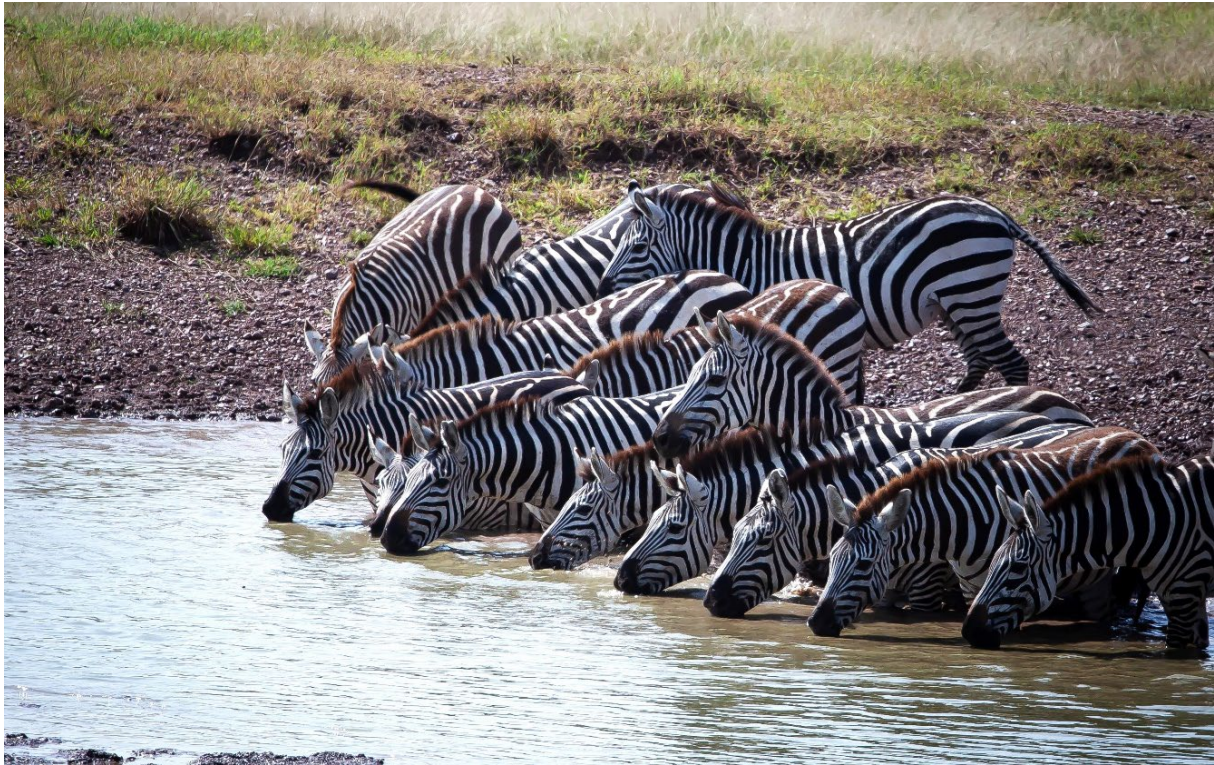
Zebra drinking at the waterhole close to Sabora. A handsome topi standing strong on the Sasakwa plains.