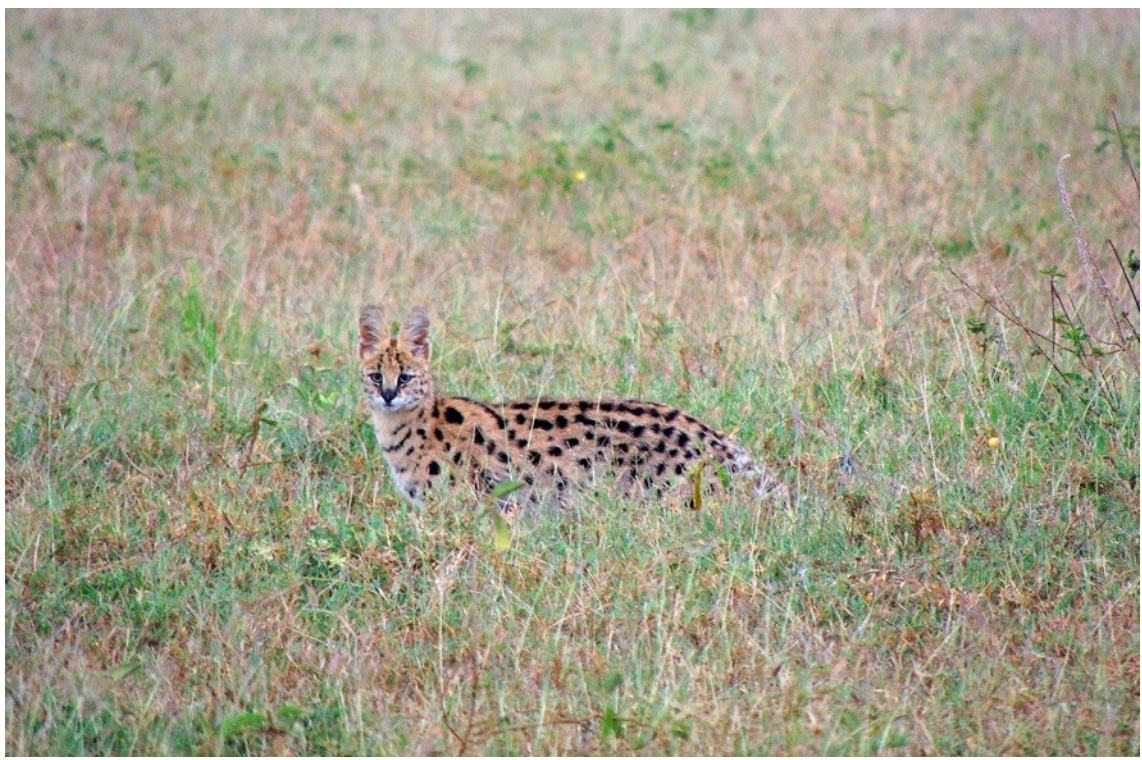
A serval could easily be mistaken for a cheetah cub at first glance.