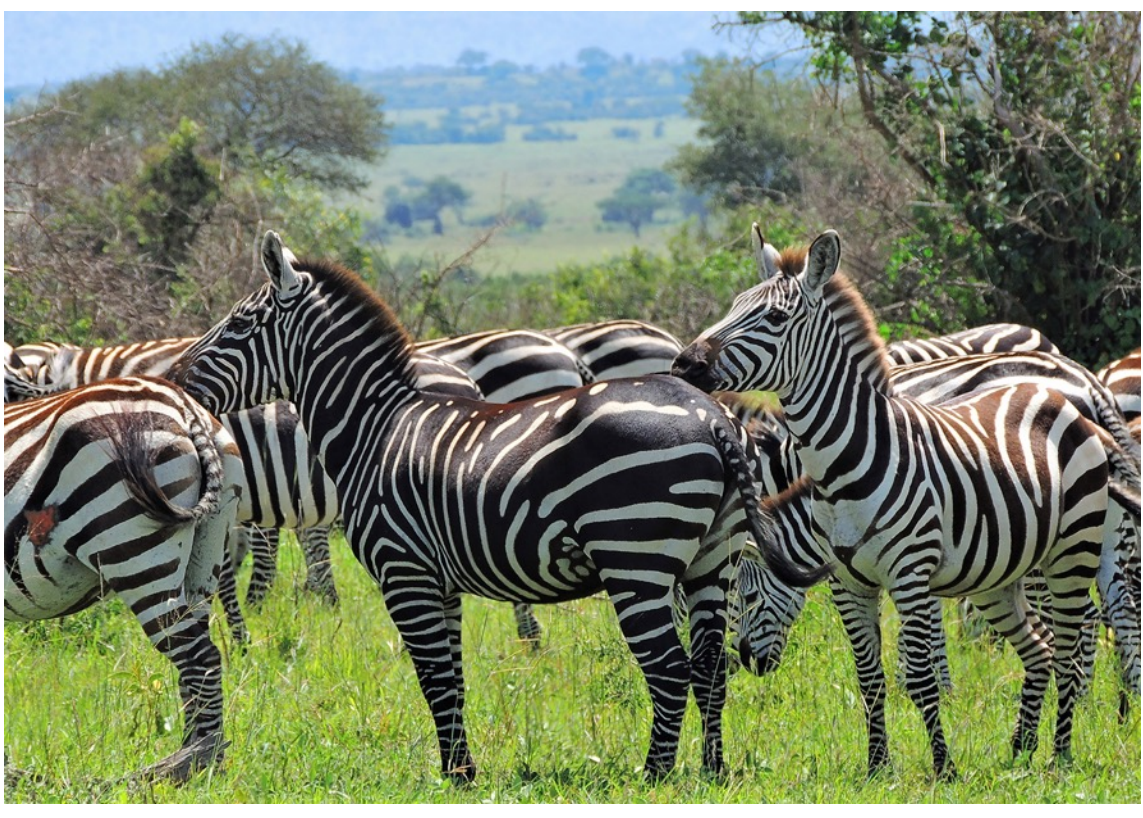
A particularly dark zebra shows of its coat.