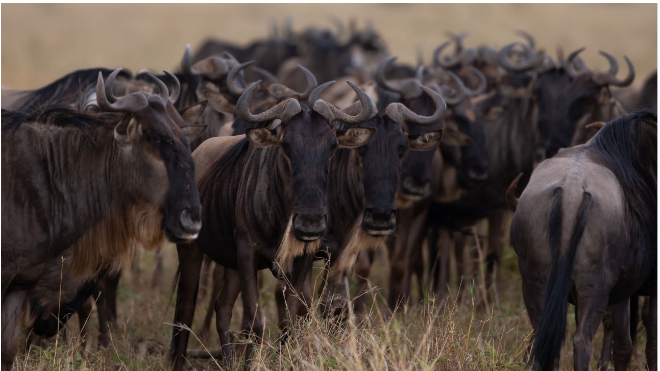
Lovely colour contrasts of wildebeest on the Sasakwa Plain.