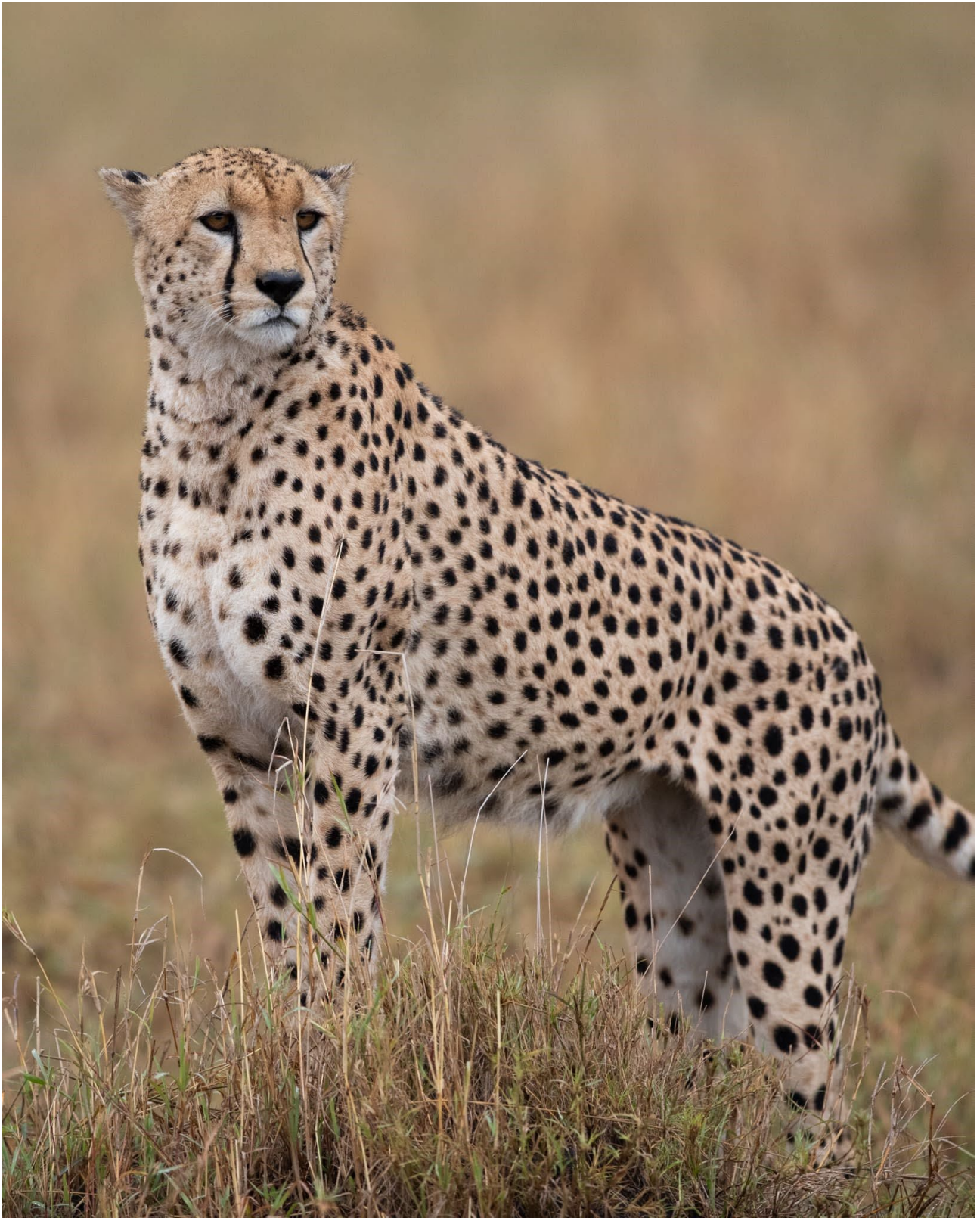
The veteran male cheetah of the Sasakwa Plains.