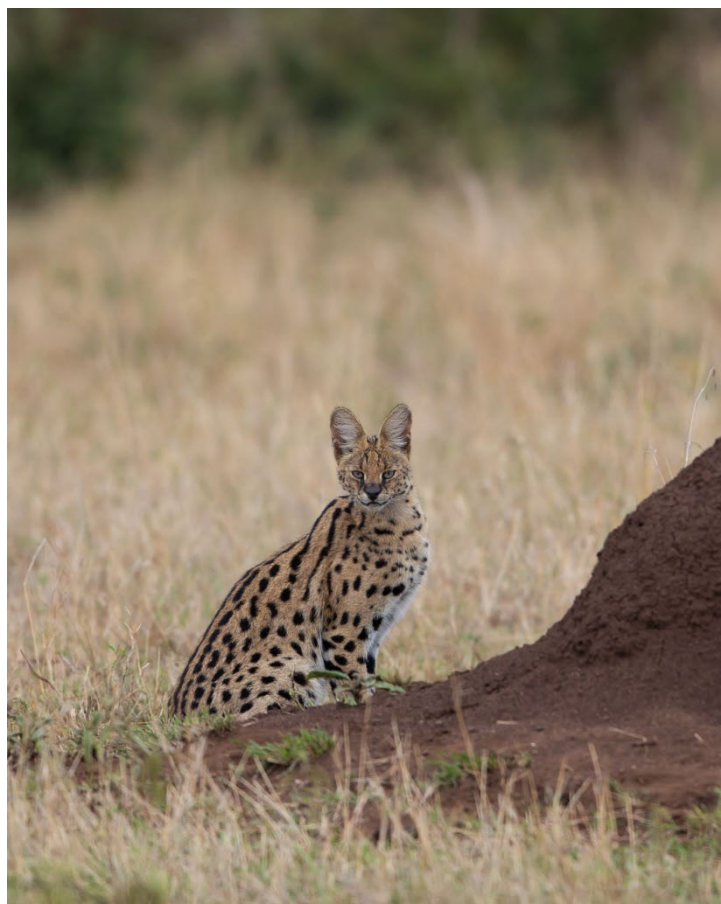
A serval