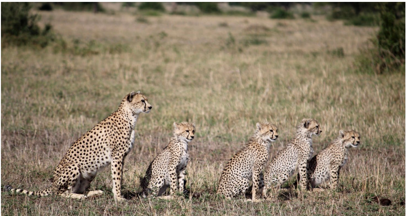
Mother and four on the plains west of Marula Explore camp.

She is a strong mother, her cubs are in good shape and she roams the Gambaranyera Plain with her youngsters close to her side. May they all go from strength to strength.