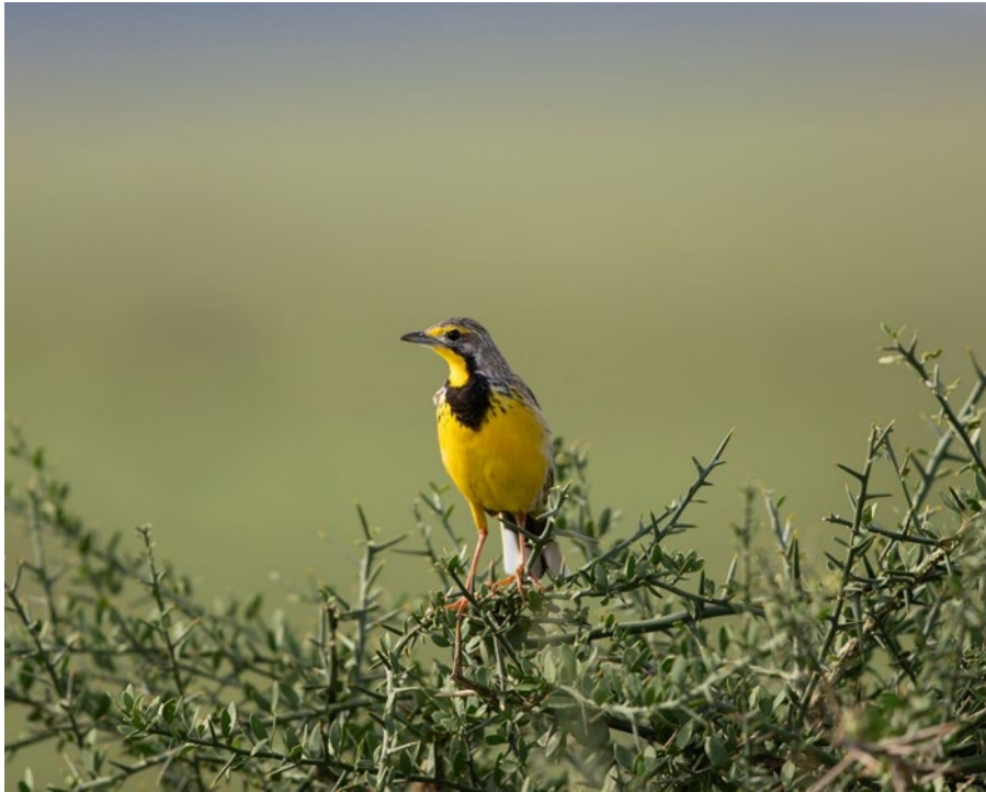
A lovely capture of this striking grassland bird the yellow-throated longclaw.