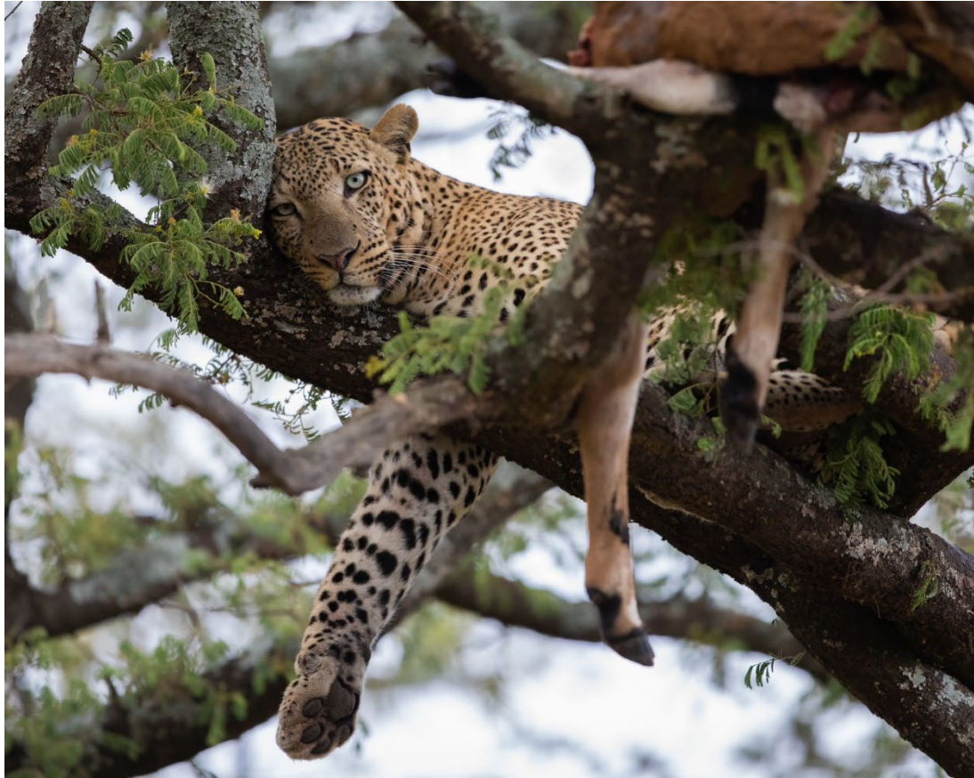
The beautiful Grumeti North drainage male leopard rests after feeding on his kill.