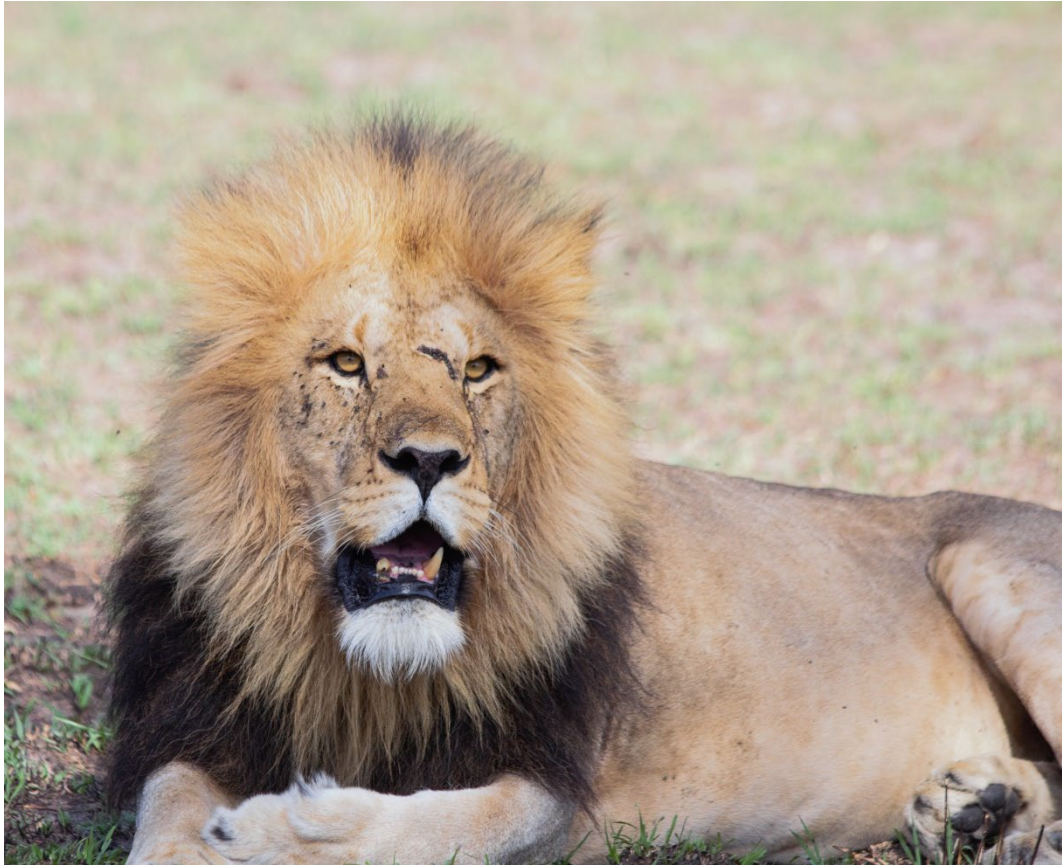
A very distinctive Kawanga lion. Notice the broken lower canine.