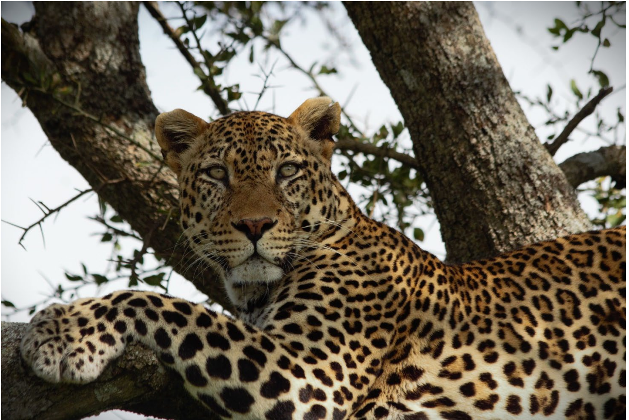
A lovely male leopard photographed by Adas Shemboko.