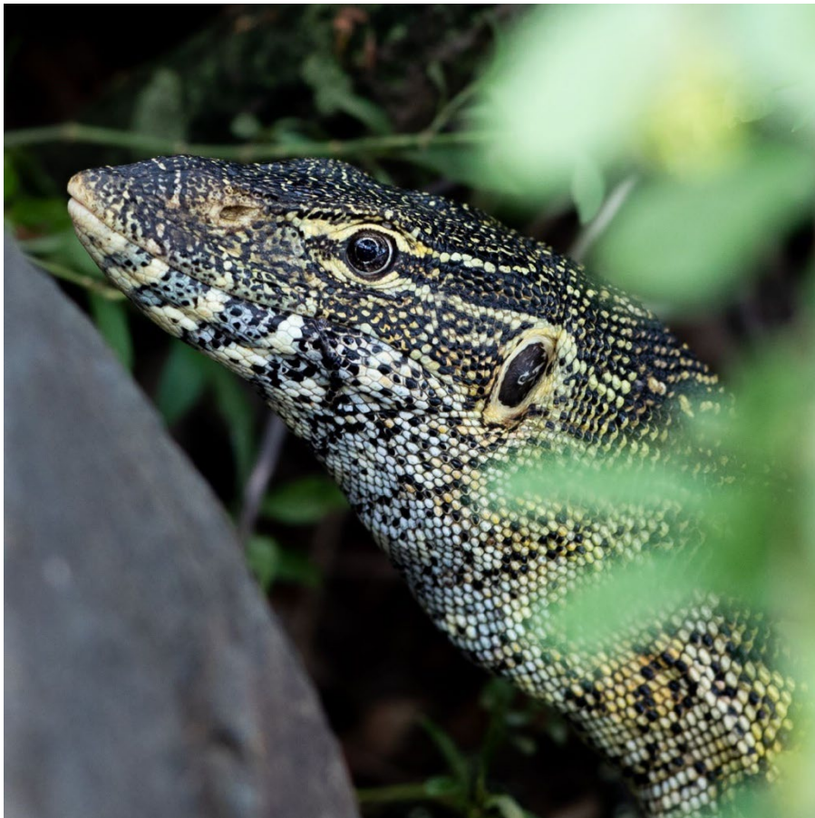
A water monitor lizard on the Grumeti River bank.