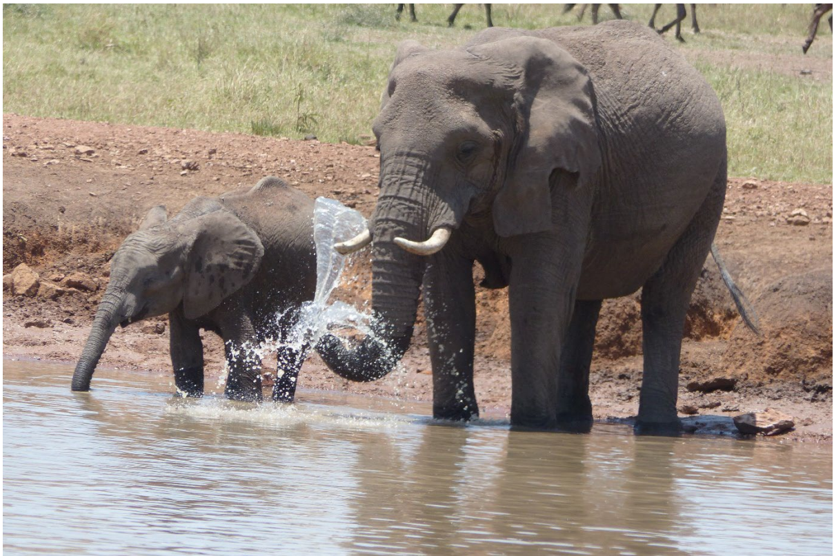
Elephants drinking at the waterhole.