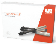
4726 - Transcend Syringe Intro Kit 1 x 4 g syringe of each shade: A1D, A2D, A3D, B1D, EN, EW, UB