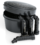
4757 - Transcend UB Singles 1pk 10 x 0.2 g singles Universal Body shade