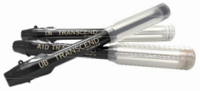
Transcend Syringe 1pk 4 g syringe