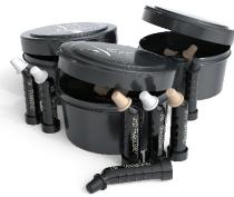
Transcend Singles 1pk 10 x 0.2 g singles