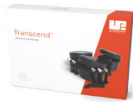
4814 - Transcend Singles Intro Kit 10 x 0.2 g singles of each shade: A1D, A2D, A3D, B1D, EN, EW, UB

Pair Composite Wetting Resin with any Ultradent composite to improve instrument and composite glide when sculpting and contouring.