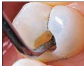
3. Remove green-black color (cariou dentin) with slow-speed round bur or excavator. To control overexcavating near the pulp, remove final portion of caries with hand excavator.