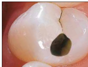
2. Rinse with air/water and suction. Carious dentin is easily identified.