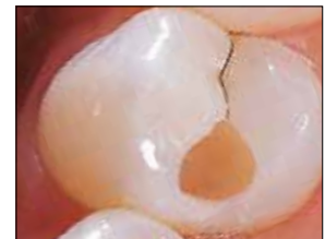
4. Reapply. Rinse and verify complete caries removal.