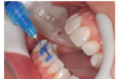
Deliver Opal Etch etchant with the Blue Micro ™ tip for precise placement.