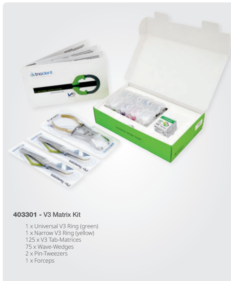
403301 - V3 Matrix Kit

1 x Universal V3 Ring (green) 1 x Narrow V3 Ring (yellow) 100 x SuperCurve Matrices 75 x Wave-Wedges 2 x Pin-Tweezers 1 x Forceps