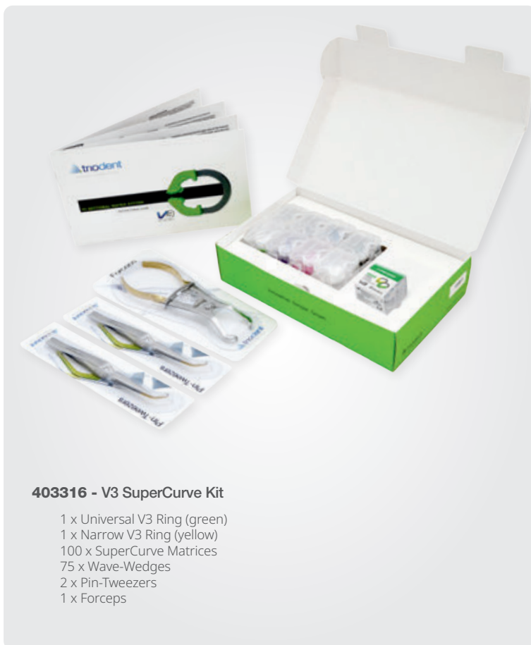
403316 - V3 SuperCurve Kit

1 x Universal V3 Ring (green) 1 x Narrow V3 Ring (yellow) 100 x SuperCurve Matrices 75 x Wave-Wedges 2 x Pin-Tweezers 1 x Forceps