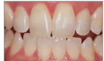
After enamel microabrasion and 21 days of whitening with Opalescence™ PF whitening.