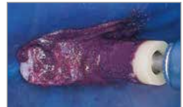
Use OpalCups™ bristle cup to compress Opalustre slurry on tooth surface using medium to heavy pressure. Suction the paste from the teeth then rinse, evaluate, and repeat as necessary. Finish treatment by polishing with OpalCups™ finishing cup.