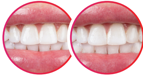
Before Gleo fluoride varnish