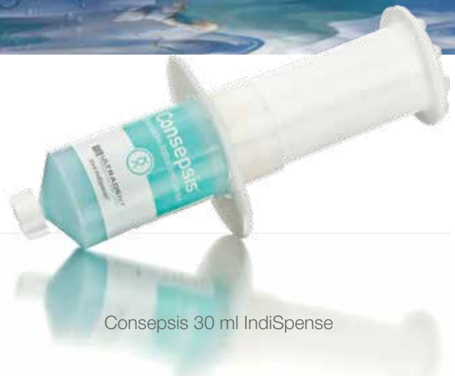
Consepsis 30 ml IndiSpense

Consepsis 2.0% chlorhexidine gluconate solution is used to clean and disinfect before bonding. Use prior to crown cementation, luting (provisional and permanent), and direct restorative placement.