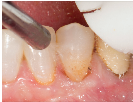
3 When bleeding stops, give a firm air/water spray to test for hemostasis and remove coagulum.