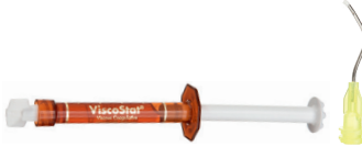
3093 - ViscoStat Dento-Infusor Syringe Kit 4 x 1.2 ml syringes 20 x Metal Dento-Infusor tips