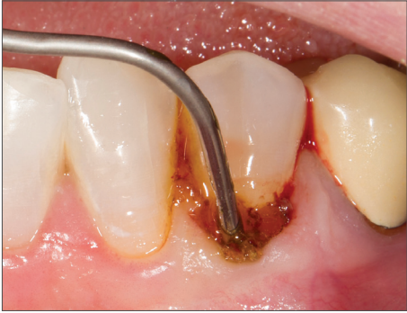
2 Astringedent X hemostatic is scrubbed firmly against bleeding tissue.