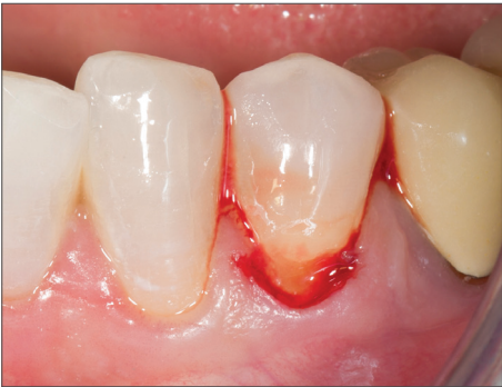
1 Bleeding at preparation.