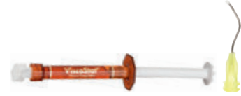
3093 - ViscoStat Dento-Infusor Syringe Kit 4 x 1.2 ml syringes 20 x Metal Dento-Infusor tips