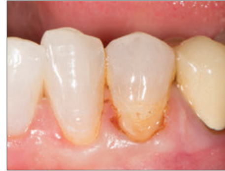
4 Profound hemostasis.