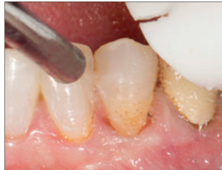
3 When bleeding stops, give a firm air/water spray to test for hemostasis and remove coagulum.