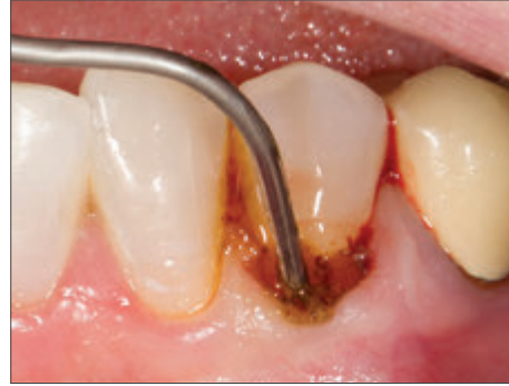
2 Astringedent X hemostatic is scrubbed firmly against bleeding tissue.