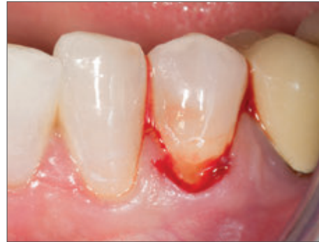
1 Bleeding at preparation.