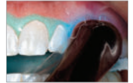
Light-reflective properties focus heat away from teeth and gingiva for patient comfort.