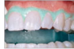
Complete barrier is ideal for tooth whitening.