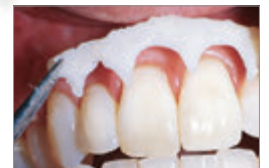
OpalDam resin cleanly breaks from undercuts.