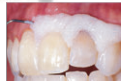
Viscous solution is easy to apply.