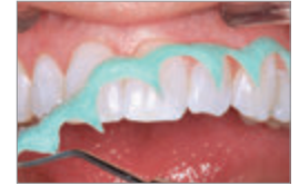
OpalDam Green resin cleanly breaks from undercuts.