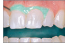
Viscous solution is easy to apply.

Refrigerate if not used on a daily basis.