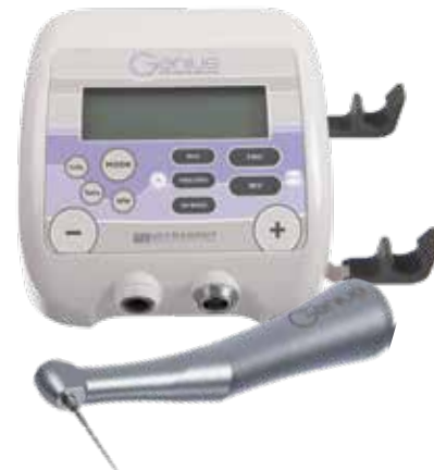
Use Genius Files with the Genius Endodontic motor and contra-angle