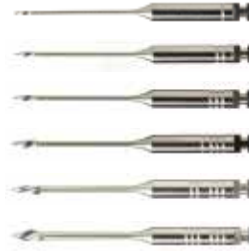
Refill and Assorted 6pk