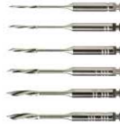
Refill and Assorted 6pk