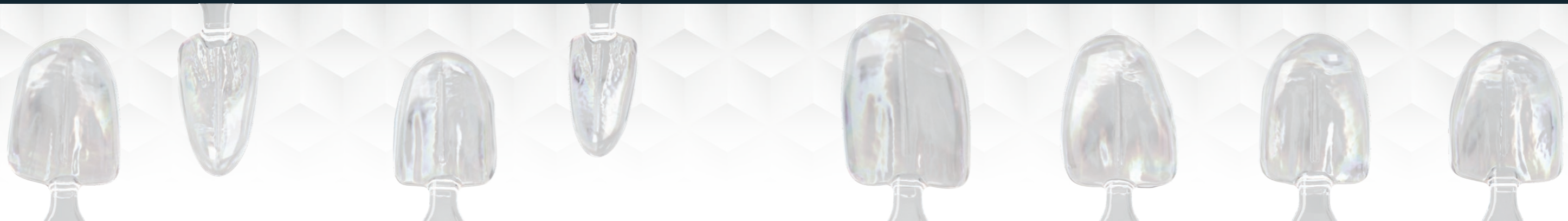
L - Large Upper