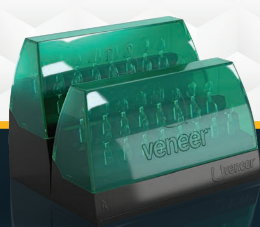
UVKV3 Uveneer Kit 16 x Medium upper and lower arch templates 16 x Large upper and lower arch templates

Medium and Large templates provide 2 central incisors, 2 lateral incisors, 2 canines, and 2 premolar templates for both the upper and lower arches.