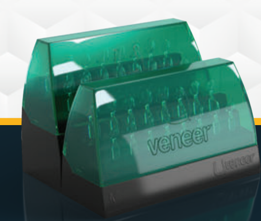
UVKV3 Uveneer Kit 16 x Medium upper and lower arch templates 16 x Large upper and lower arch templates

Medium and Large templates provide 2 central incisors, 2 lateral incisors, 2 canines, and 2 premolar templates for both the upper and lower arches.