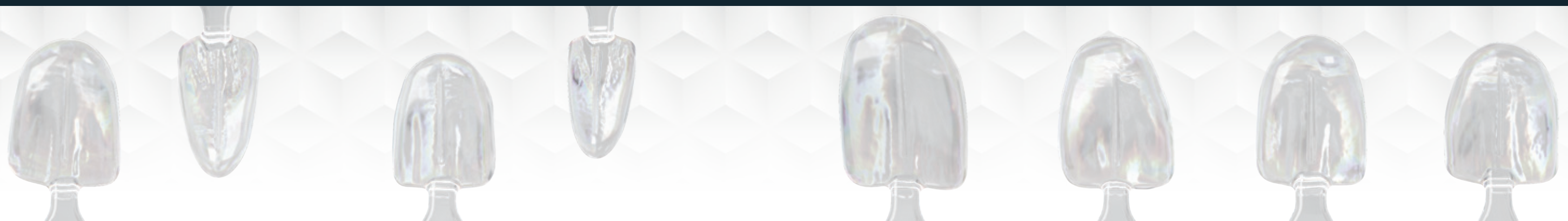
L - Large Upper