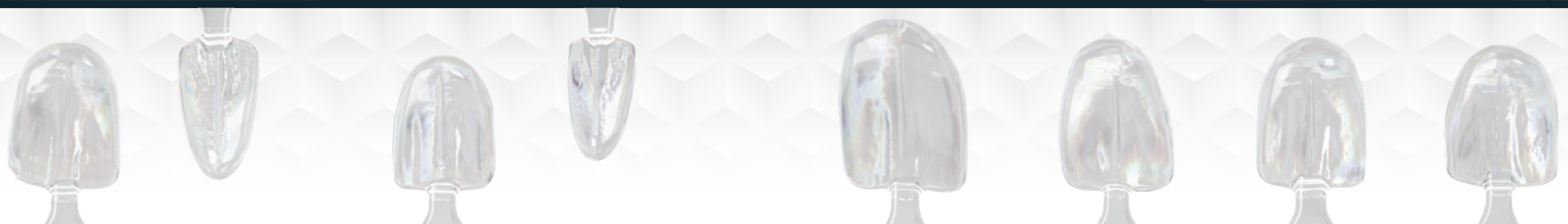
L - Large Upper