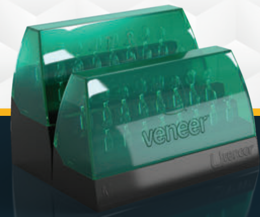
UVKV3 Uveneer Kit 16 x Medium upper and lower arch templates 16 x Large upper and lower arch templates

Medium and Large templates provide 2 central incisors, 2 lateral incisors, 2 canines, and 2 premolar templates for both the upper and lower arches.