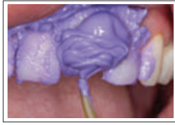
2. Cover preparation in wash material.