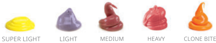
SUPER LIGHT LIGHT MEDIUM HEAVY CLONE BITE