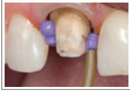
1. Start by applying wash material around outer edges of preparation.