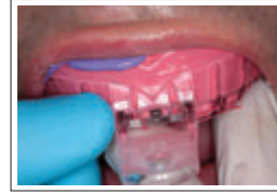
3. Insert tray and make impression.