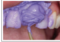
2. Cover preparation in wash material.