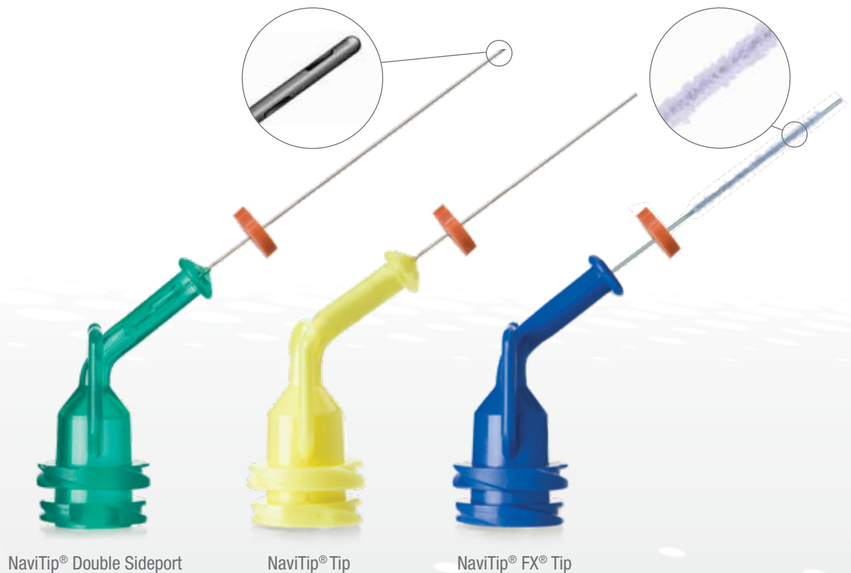
NaviTip® Double Sideport

When it comes to root canals, Ultradent is with you every step of the way.