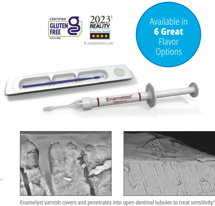
Enamelast varnish covers and penetrates into open dentinal tubules to treat sensitivity 3

Enamelast fluoride varnish is designed with staying power. It contains a patented adhesion-promoting agent and has a smooth feel and nearly invisible appearance that your patients won't want to brush off. Plus, Enamelast varnish comes in six great choices your patients will love— Walterberry, Orange Cream, Bubble Gum, Cool Mint, Caramel, and Flavor-Free!