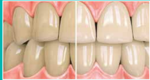
RELATIVE DENTIN ABRASION (RDA) 4

Removes surface stains to lighten teeth up to two shades in just one month! 1