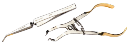
PIN-TWEEZERS and FORCEPS