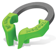
UNIVERSAL V3 RING