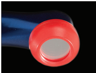
The Black Light lens magnetically attaches to the VALO Ortho light.