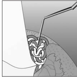
Fig. 1 Larger, softer cord cradles instrument tip. As loops seek to open, a gentle, continuous outward force is exerted.

HAZARD RATING 4 = Severe 3 = Serious 2 = Moderate 1 = Slight 0 = Minimal