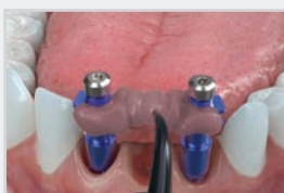
SPLINTING BETWEEN IMPLANT COPINGS