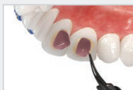
BITE RAMPS & TEMPORARY OCCLUSAL BUILDUPS