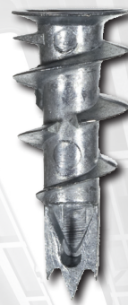
PDM Plasterboard Anchor