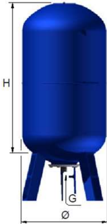
PORTABLE 50 - 1000 Litres