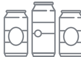
Aluminum Cans Sort by Material

When separated aluminum can be recycled into new aluminum products.