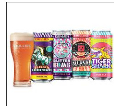
multiple sku example