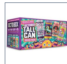
mixed pack example