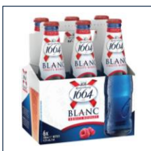
bottle pack example

ASSET COMPOSITION SHOULD INCLUDE EACH SKU AS A SINGLE OBJECT ON A TRANSPARENT BACKGROUND, EXAMPLES BELOW