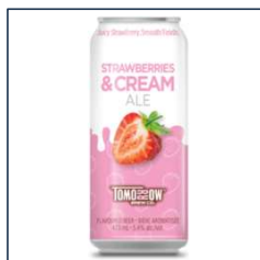
single can example