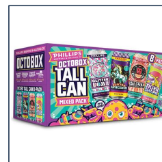
mixed pack example