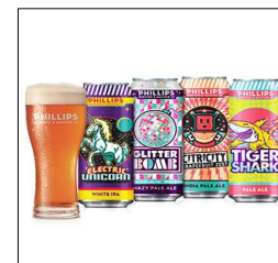
multiple sku example