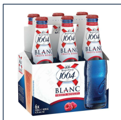
bottle pack example

ASSET COMPOSITION SHOULD INCLUDE EACH SKU AS A SINGLE OBJECT ON A TRANSPARENT BACKGROUND, EXAMPLES BELOW