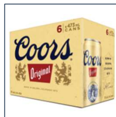
can pack example