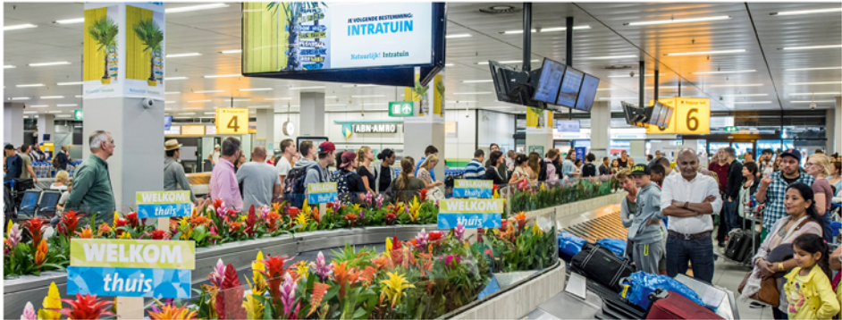
Dwell time: 146 minutes