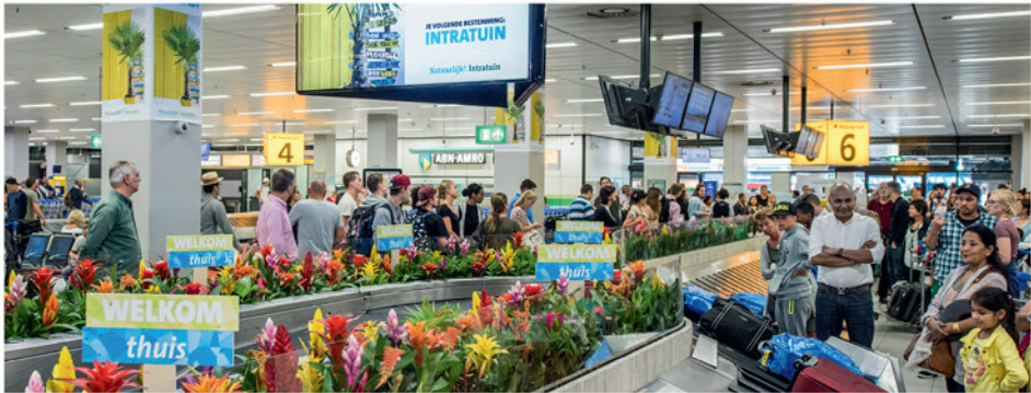
Dwell time: 146 minutes