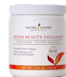
Inner Beauty™ Collagen Item No. 40578