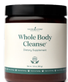
Whole Body Cleanse™ powder Item No. 47953