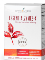
Essentialzymes-4™ supplement Item No. 4645