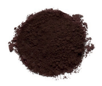
Multitasker 409 - Dark Brown Item No. 22002