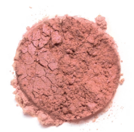
504 - Smashing Item No. 21958

Our easy-to-apply blush gives skin a perfect flush that lasts all day! Whether you're looking for romantic rosiness or youthful luminosity, give your skin a healthy glow with Savvy Minerals by Young Living™ Blush.