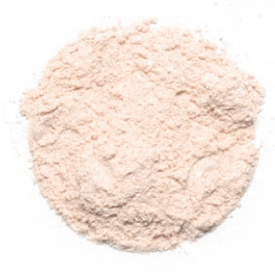
Veil 505 - Diamond Dust Item No. 22005

Add a flawless finish and a sheer luminosity to your look with Savvy Minerals by Young Living™ Veil in Diamond Dust. Veil's luminising formula applies smoothly, creates highlights and blurs fine lines and pores, leaving you with a glowy, airbrushed finish. This long-lasting veil absorbs excess oil to hold your foundation in place and keeps you looking radiant all day, every day!