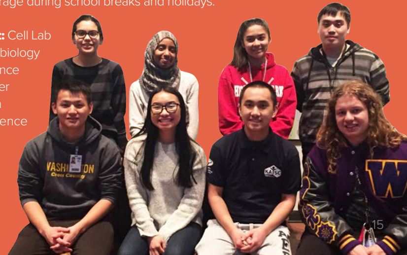
Cell Lab Crew

How the Cell Lab Crew has made an impact: Cell Lab Crew focuses on community by implementing biology content in the Human Body Gallery of the Science Museum of Minnesota. In the Cell Lab, they offer museum visitors fun, interactive, and hands-on experiences. They also help explain how science is related to everyday life.