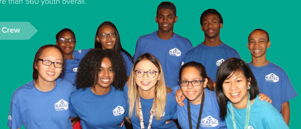
Teen Tech Crew

How the Teen Tech Crew has made an impact: We bring youth voices and leadership to spaces where they typically aren't found! The Teen Tech Crew has created more than 75 hands-on STEM activities that we offered in libraries through Createch, and we trained 30 new youth to lead technology classes in Hennepin County libraries, engaging more than 560 youth overall.